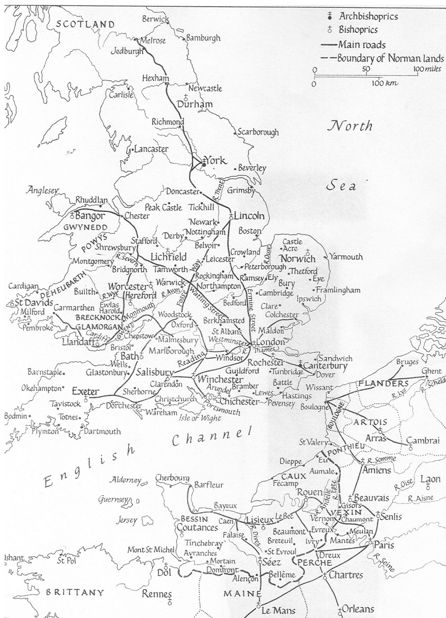
Figure 4. The Anglo-Norman Realm (1066–1154) (The Oxford Illustrated History of Britain)