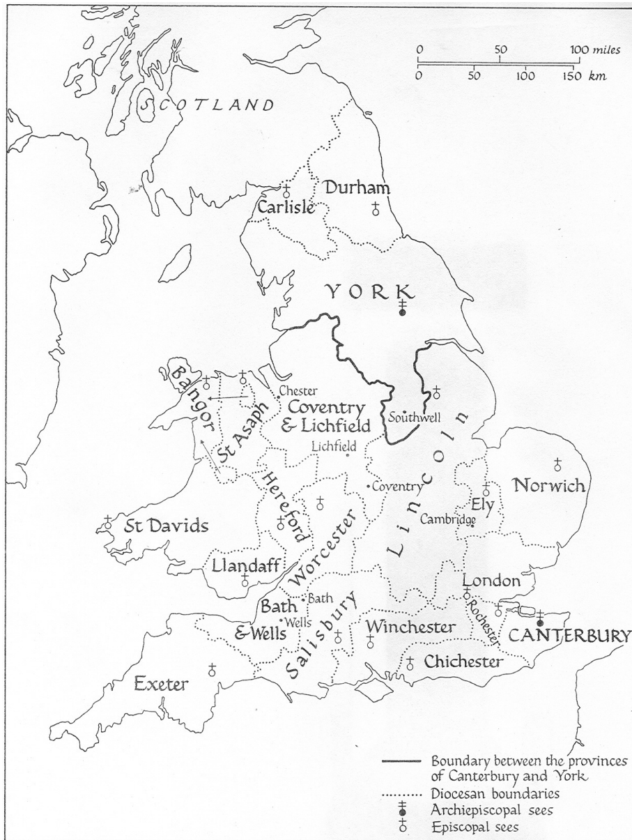
Figure 5. The Pre-Reformation Dioceses of England and Wales (13 th century) (The Oxford Illustrated History of Britain)