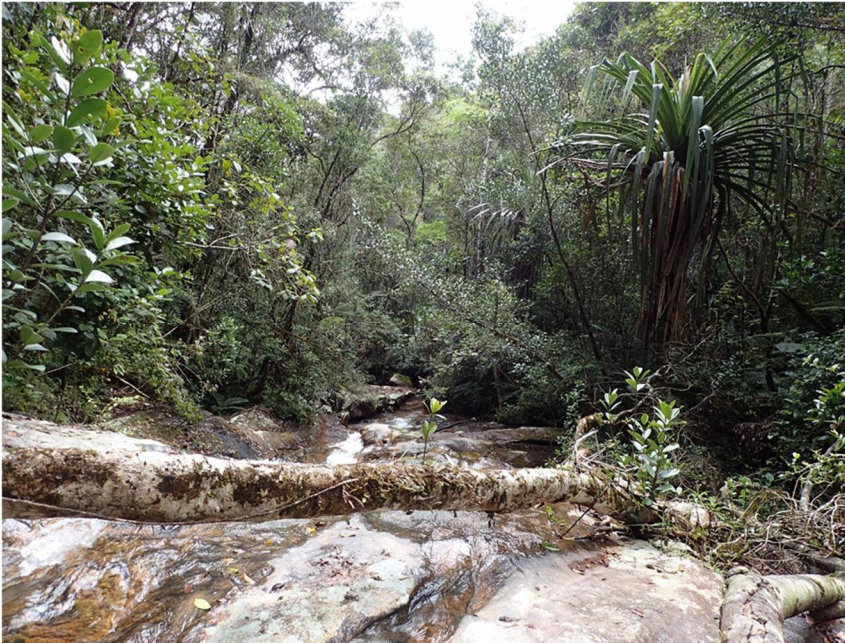
Figure 2. A view of Mantadia National Park, a sempervirent humid forest, with a medium high (10–15 m) canopy.

only 0, 42% of Madagascar's total surface. Although this mid-altitude humid forest ( Figure 2 ) is one of the best explored regions in the country, and the climatic conditions are very favourable for a rich bryoflora, as well as to vascular plants (Koechlin 1972), the exceptional bryological richness is an additional argument for conservation efforts, which are unfortunately threatened by severe deforestation, even in the vicinity of or within the boundaries of the National park.