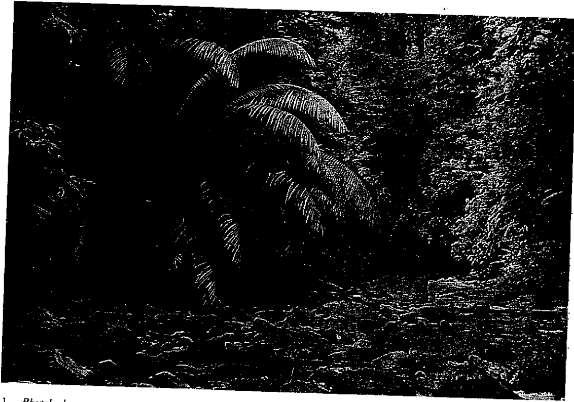
1. Phytelephas seemannii growing along a stream near the Cerro Pirre station of the Darién National Park, Panamá.

Fruits of P. seemannii are found in large club-shaped infructescences borne on interfoliar stalks that project from between the leaf bases and are usually less than 0.5 m above the ground (Fig. 2). The coarsely-spined infructescences consist of several fruits, each of which contains an average of 5 seeds. A single infructescence can contain up to 8 fruits and, therefore, 40 seeds. In the Darién, we found palms with over a dozen infructescences developing simultaneously. Individuals of P. aequatorialis may have >40 infructescences at any one time (Julie Velásquez, pers. comm.). Seeds of both P. seemannii and P. aequatorialis are initially protected from seed-predators by the thick (ca. 1 cm), fibrous fruit wall.