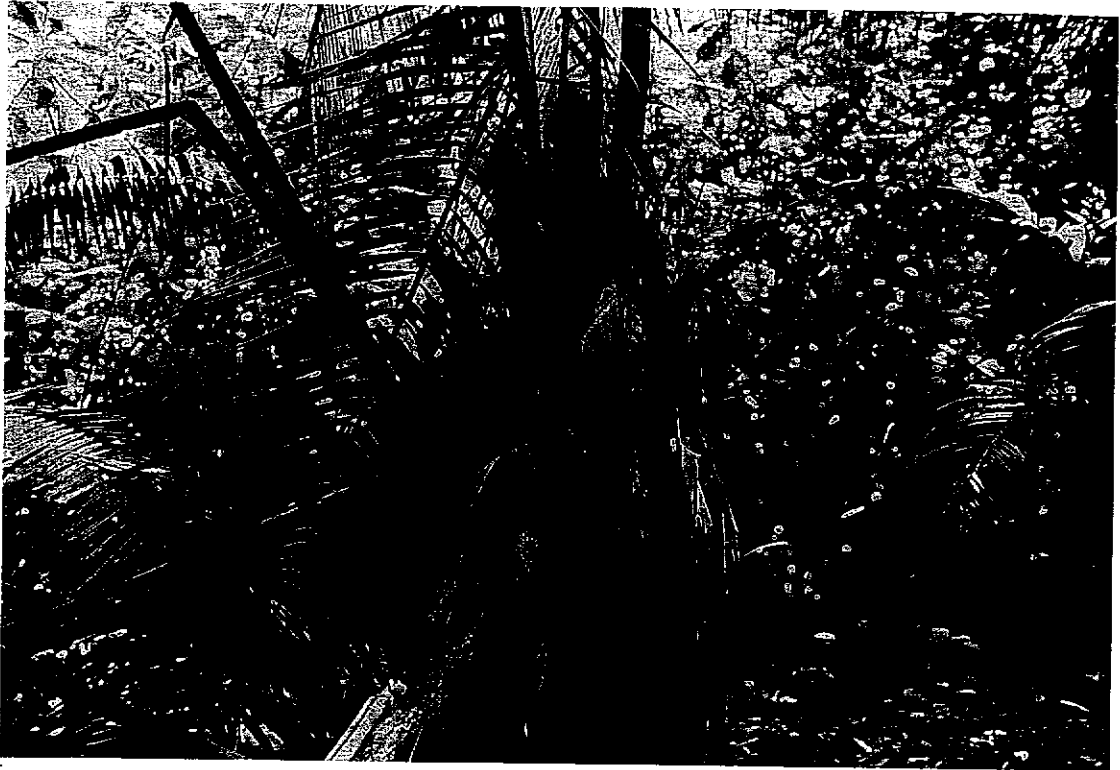
3. Phytelephas seemannii from which leaves have been harvested for thatch; found just inside the boundary of the Darién National Park, Panamá.

lands surrounding this community have now been converted to agriculture it was the impression of the older villagers that tagua had never grown in the immediate area. Instead, tagua is collected approximately 30 km away within the Darién National Park and within the cordillera of Cerro Pirre. Collection trips by villagers take five days and are made at intervals of approximately three months; each craftsman collects about 80 seeds per trip. There are currently six craftsmen and several apprentices carving tagua in Vista Alegre; the annual production of tagua carvings for this community is therefore approximately 2,000 finished pieces, each made from a single seed.