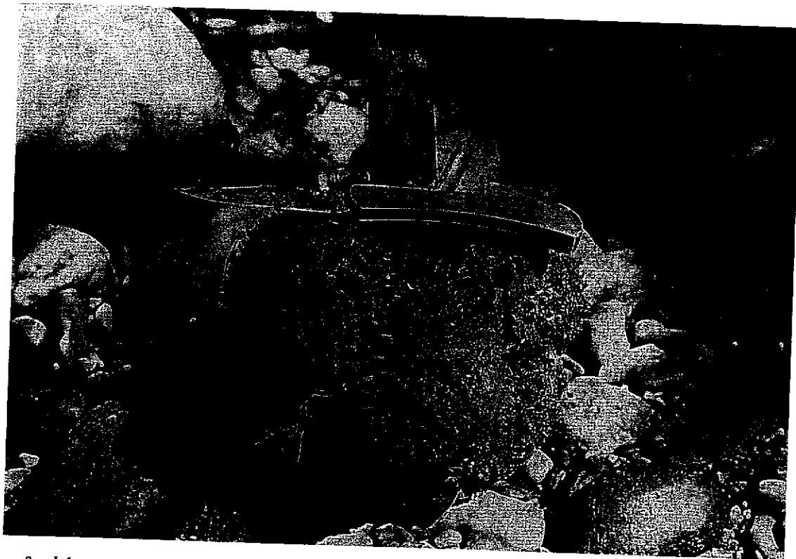
2. Inflorescence from Phytelephas seemannii growing along the same stream as in Fig. 1.

an insect introduced to the Americas with date palms (Wood 1982). Johnson et al. (1995) report a collection of a bruchid beetle (Bruchidae) from seeds of a species of Phytelephas . The previous two reports did not identify the palm to the species-level. Finally, Borgtoft-Pedersen (1993, 1995) reports that a bruchid beetle, Caryoborus chiri-quensis , is a serious seed-predator on P. aequatorialis in parts of that palm's range.