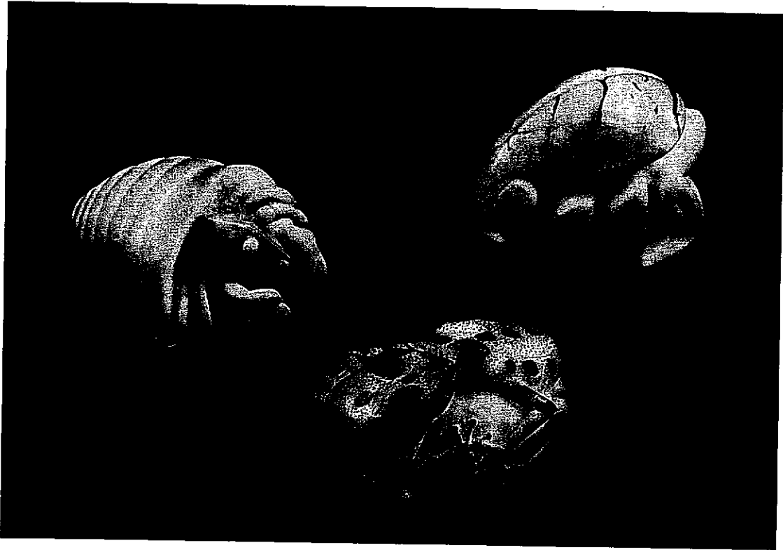
5. Figures carved from tagua.

nuts of the related species, P. aequatorialis , take between four and seven years to mature (Borgtoft Pedersen 1993). It seems unlikely that seed maturation times for P. seemannii would be much different, and actual per annum fruit production from the population we investigated would therefore be quite low. Finally, if the market for carved tagua continues to increase, e.g., as Barfod et al. (1990) predicted for Ecuadorian tagua, the pressure on existing exploited P. seemannii populations will increase.