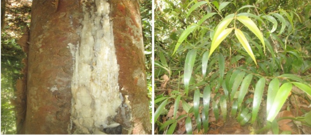
Figure 2. A. labillardieri Warb stem and saplings.

Wasis et al. (2018) stated that the application of potassium fertilizer (KCl) twice in 6 months shows a very significant increase in the production of Agathis spp (copal) sap. In this study, it was observed that the condition of the plant was quite good, with a substantial production of latex (Figure 2). It was estimated that the characteristics of A. labillardieri Warb growing sites in this region were very supportive of the growth and production of sap (copal). Therefore, the development of the growing site characteristics of A. labillardieri Warb needed to be taken into consideration for future copal production.