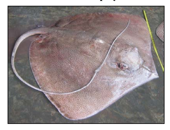
5. Reticulate whipray