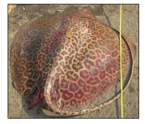
3. Leopard whipray

maturity at under 49 cm (19 in) across, and females at under 70 cm (28 in).