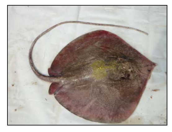
7. Scaly whipray

Family: Dasyatidae Scientific name: Himantura imbricata (Bloch and Schneider, 1801) English name: Scaly whip ray Local name: Housh (Shapla pata)