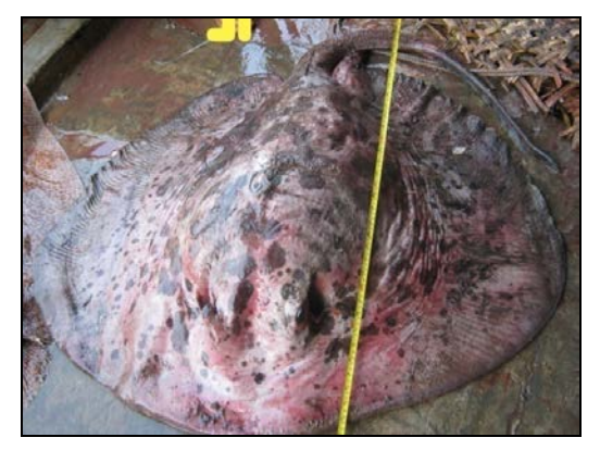
13. Blotched fantail ray

Size: Adults reaching at least 180 cm disc width, exceeding 300 cm total length; size at birth about 18 cm disc width, 50 cm total length or larger.