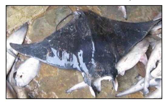
22. Javanese cow nose ray