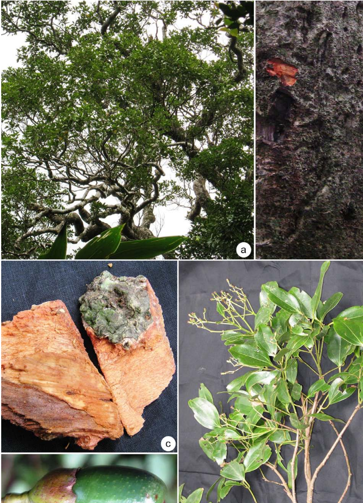
Fig. 2. Cinnamomum litseaefolium Thwaites: a. Habit; b. A view of bark on the trunk; c. Closer view of bark; d. A flowering twig; e. A fruit.