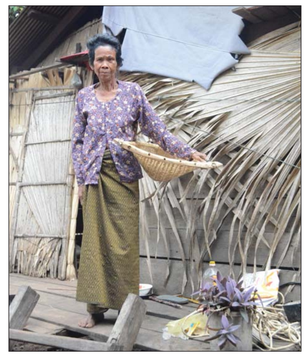
Fig. 2 Kuy woman carrying a handmade basket outside a traditional house. Phneak Roluek Village, Preah Vihear Province, September 2014.