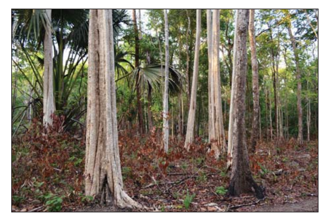
Fig. 5 Sralao' ( Lagerstroemia sp.) forest. Preah Vihear Province, April 2015.