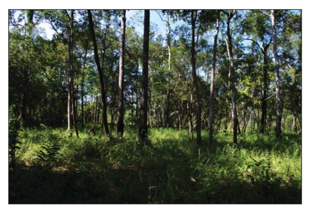
Fig. 4 Deciduous forest. Stung Treng Province, September 2014.