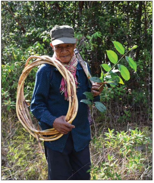
Fig. 3 Plant collector in Prey Lang, near Spong Village, Stung Treng Province, May 2015.