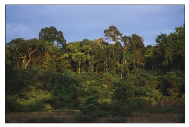
Fig. 6 Short semi-evergreen forest and evergreen dipterocarp forest. Preah Vihear Province, December 2016.