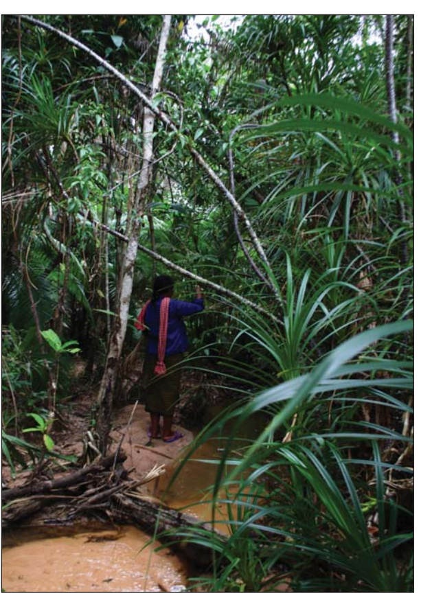
Fig. 7 Evergreen swamp forest. Stung Treng Province, December 2016.