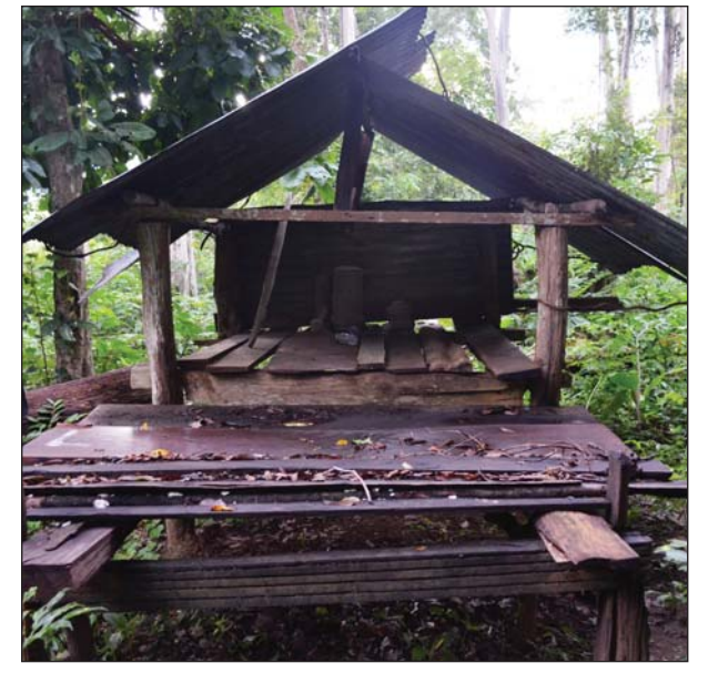
Fig. 8 Spirit house near Phneak Roluek. Preah Vihear, September 2014.

Cambodian Journal of Natural History 2017 (1) 76-101