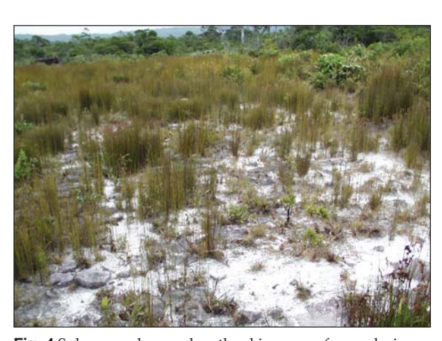
Fig. 4 Sphagnum bog and wetland in areas of poor drainage on the Bokor Plateau, March 2001.