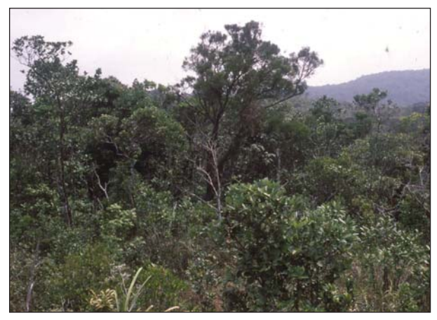
Fig. 2 Stunted forest of the Bokor Plateau with emergent trees of Dacrydium elatum , March 2001.