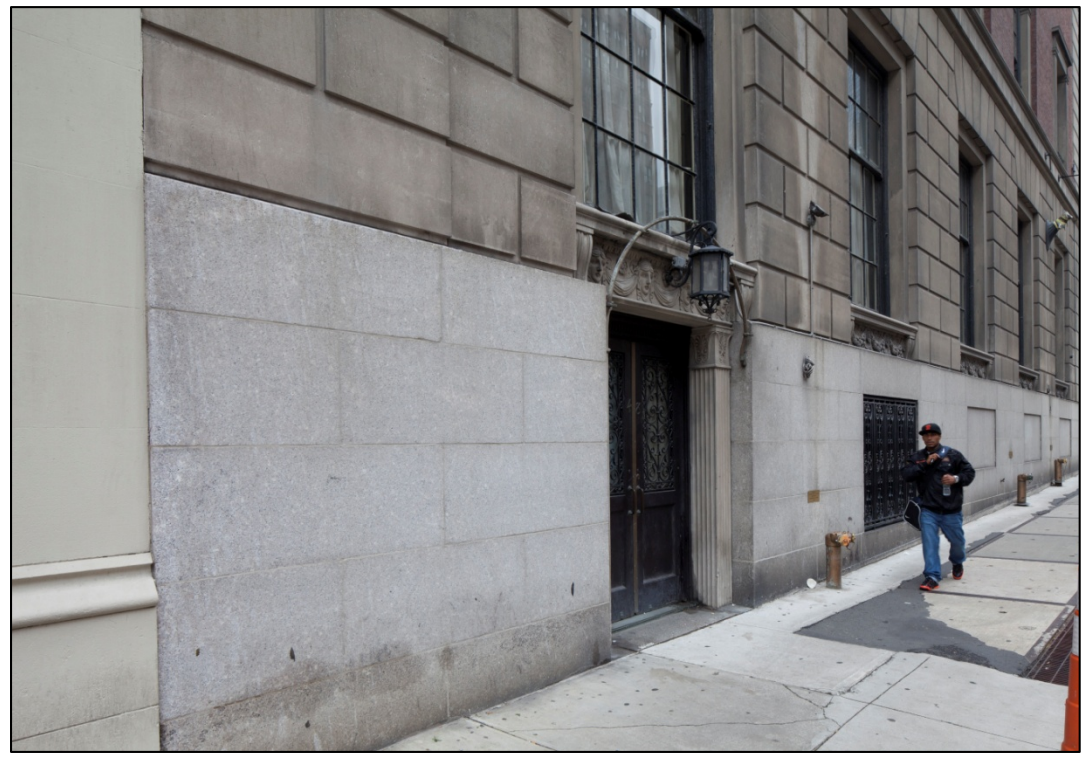
Union League Club Base of 37<sup>th</sup> Street facade; Park Avenue (Women's) entrance Photos: Christopher D. Brazee, 2011