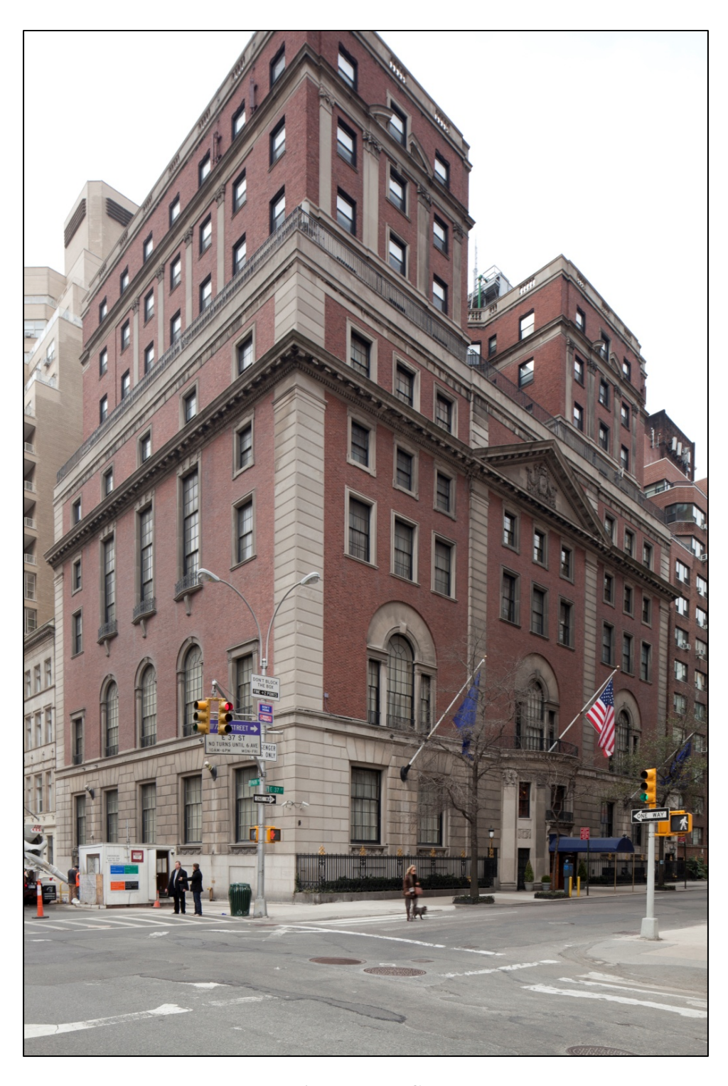
Union League Club 38 East 37<sup>th</sup> Street (aka 34-38 East 37<sup>th</sup> Street), 48 Park Avenue) Borough of Manhattan Tax Map Block 866, Lot 42 East/North façades, viewed from Park Avenue