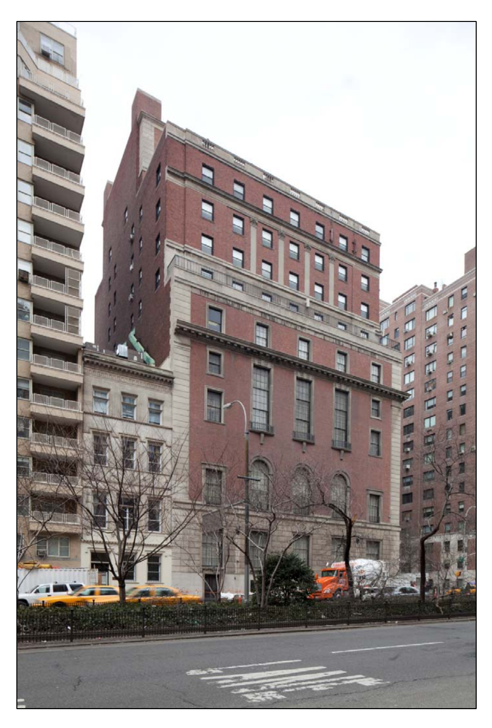
Union League Club South/East facades, view from Park Avenue