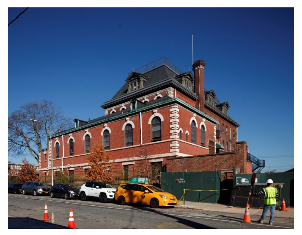
South Wing 64th Street facade (rear) Jessica C. Baldwin, November 2020