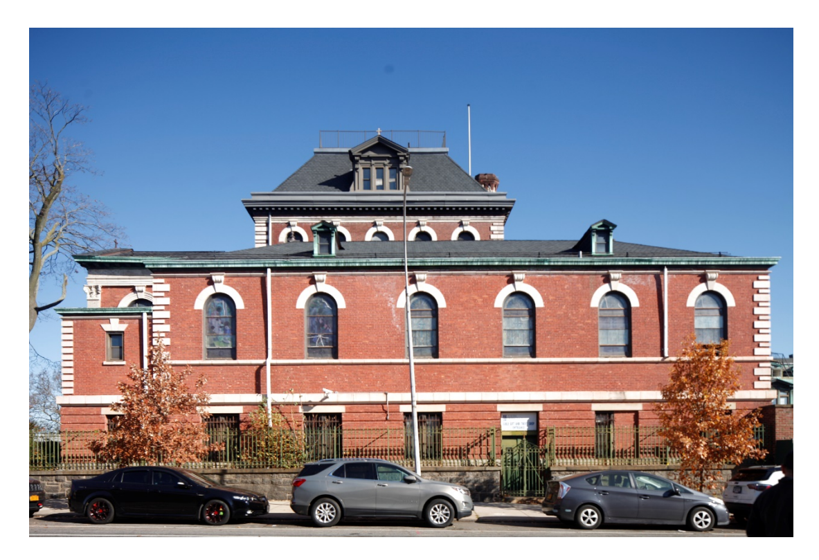
South Wing 64th Street facade Jessica C. Baldwin, November 2020