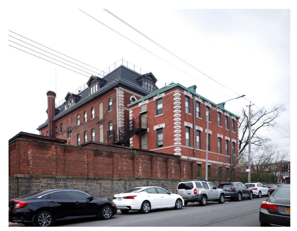
North Wing 63rd Street facade (rear) Jessica C. Baldwin, November 2020