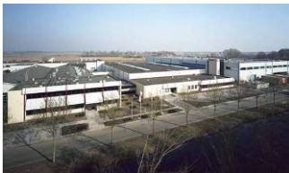
Ubbink BV [NL, Doesburg]