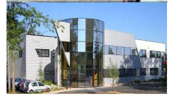
Ubbink France SAS [F, Nantes]