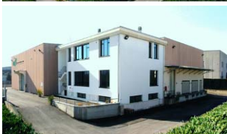
Centrotherm Italia SLR [I, Verona]