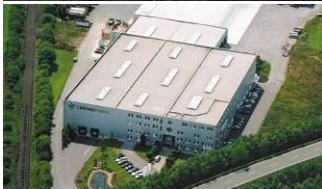
Centrotherm Systemtechnik GmbH [D, Brilon]