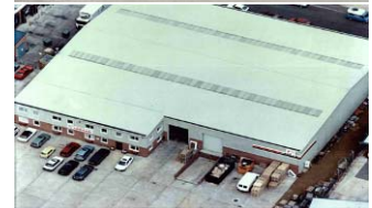
Ubbink UK Ltd. [UK, Brackley]