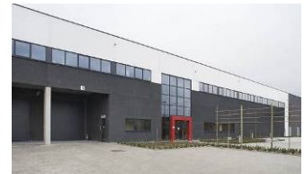
Ubbink NV/SA [B, Gent]