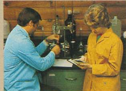
IN THE LABORATORY . . .