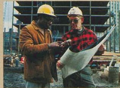
IN THE FIELD . . .

WHEN SOLVING PROBLEMS IS YOUR JOB, YOU'LL FIND THE HP-21 A VALUABLE COMPANION . . .