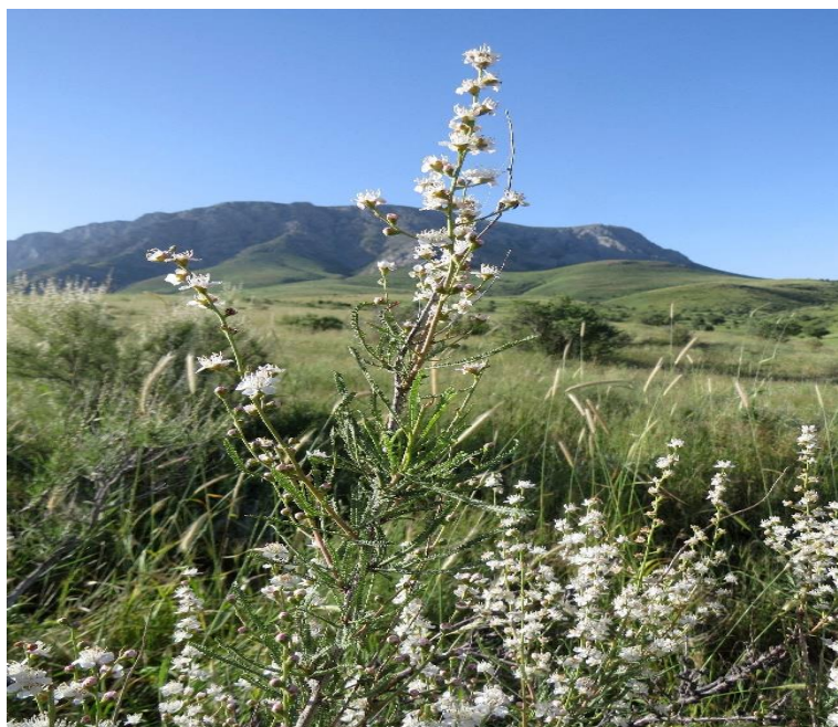
Figure 1. Spiraeanthus schrenkianus (Fisch. and C.A. Mey.) Maxim. in the Boroldaytau mountains.

It grows on mountain slopes ranging from 12°–18°, and at an altitude of 600–850 m above sea level. It also grows on long and slightly diagonal slopes with a slope (2°–5°) covered with a continuous layer of loess (Kupriyanov et al. , 2017). The habitat of S. schrenkianus includes the Syrdarya Karatau, the Chu-Illi mountains, and the Betpak-Dala