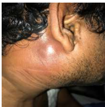
Fig-1: Showing right side neck swelling

Thus the diagnosis of primary tuberculosis parotid gland was made and patient was started on anti tuberculosis treatment containing rifampicin, ethambutol, isoniazid and pyrazinamide.