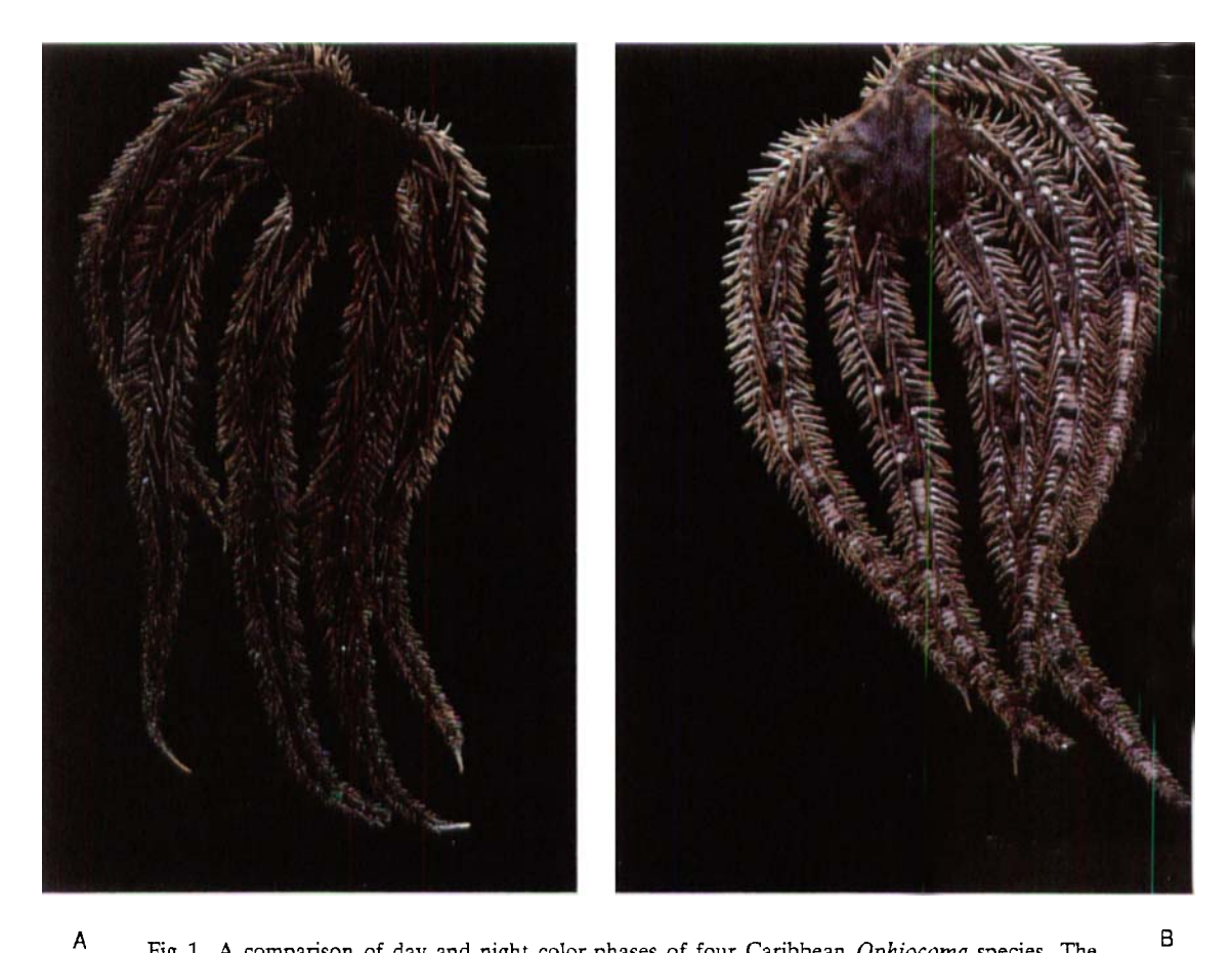
Fig. 1. A comparison of day and night color-phases of four Caribbean Ophiocoma species. The identical individual of each species is shown at 1400 hours (day) and rephotographed at 2000 hrs E (night). Ophiocoma wendti, disc diameter 18.8 mm: A, day; B, night.