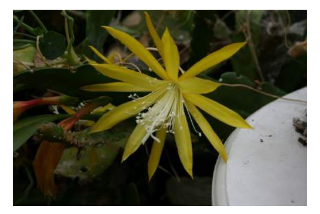
'Yellow Paetz' - HP 2007 Inner and outer petals brass yellow. Wheel shaped, wide form. Flat tall growth. {S-M} 'Natasha Paetz' × 'Diana Paetz'. Reg. #13171

'Norwood' - FRE 1987 Orange with magenta edge and solid magenta throat. Outer petals jasper red. Double, wide form. thick, triangular growth. {XL} 'Ming Gold' × 'Herbert S. Irwin'. Reg. #10388