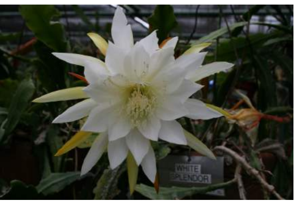
'White Splendor' - FRE 1986 First row petals white, yellow tips. 2nd row upper half yellow, 3rd row all yellow. Outer petals empire yellow. Loose double, opens wide. Stamens cascade, style white. Thick tall flat growth. {XL} 'Tele' × 'Jennifer Ann'. Reg. #10313