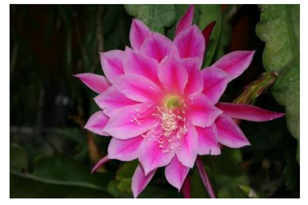
'Casino Royale' - WATTS (PITT) 2003 Inner petals cerise with a red midstripe and a lavender edge. Outer petals cerise with a red midstripe. Overlapping, cup and saucer form. Flat tall and basket growth. {XL} 'Show Boat' × 'Space Rocket'. Reg. #12775