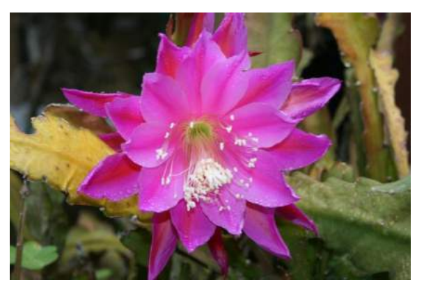
'Great Waltz' - FOB(STEP) 1952 Light purple with orange midstripe. Wide petals. Opens flat. {XL} 'Pegasus' × 'Annie P. Williams'. Reg. #07077