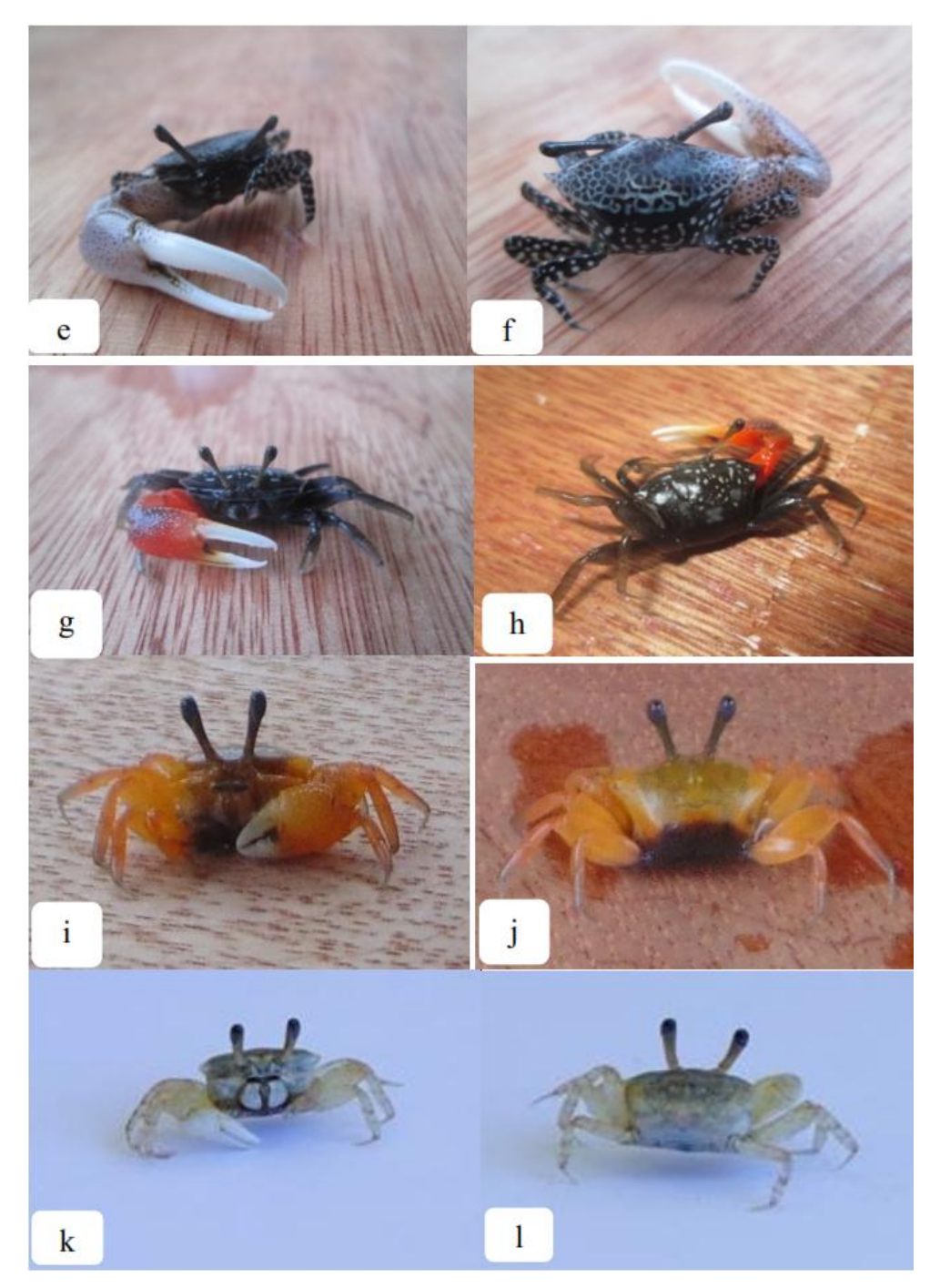
FIGURE 1. Frontal and carapac view of U. perplexa ( a , b ); U. jocelynae ( c , d ); U. triangularis ( e , f ); . U. rosea ( g , h ); U. coarcata ( I , j ) and U. lactea ( k , l ).

Uca perplexa along with U. jocelynae were found at all stations. Uca perplexa was recorded in higher number compared to remaining five species. U. jocelynae at Pulau Bai possess three different color variation of its carapace, but carapace pattern was same. These difference could be caused by internal factor as genetic factor or external factor as ecological condition at those three stations. Uca triangularis was only found at station 1. It made burrow among mangrove root. This species differed easily to othes species due to intense white carapace with grey spots and grey striped pleopods. Uca rosea also only found at station 1, possess black color carapace with small number of white spots at anterior body. Pleopods has same color with carapace and claw was bright red. Uca coarcata also anly found at station 1. It lives at watered mud substrate. Uca lactea was fond at station 1, possesses white color carapace and white claw.