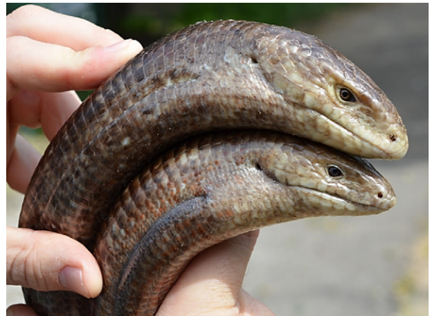
Figure 1. An example of sexual dimorphism of head size in the sheltopsuk Pseudopus apodus . The male (above) has a much larger head than the female, whereas the snout–vent length is similar (401.2 mm in the female, 403.9 mm in the male).

Male SVL was longer than female SVL in 55.7% of the species (340 of 610). Male heads, however, were longer than female heads in a higher proportion of the species (423 of 610, 69.3%). Male abdomens were longer in only 52.5% of the species (320 of 610). If selection operated solely on body size, we would have expected that males in similar numbers of species would have longer heads and abdomens, and that this proportion would be similar to the proportion of males with longer SVLs. This was not the case, suggesting that different selection types operate on specific body parts in males and females. When SSD biases differed between the sexes, there were many more species in which males had longer heads and females had longer abdomens than species with longer female heads and