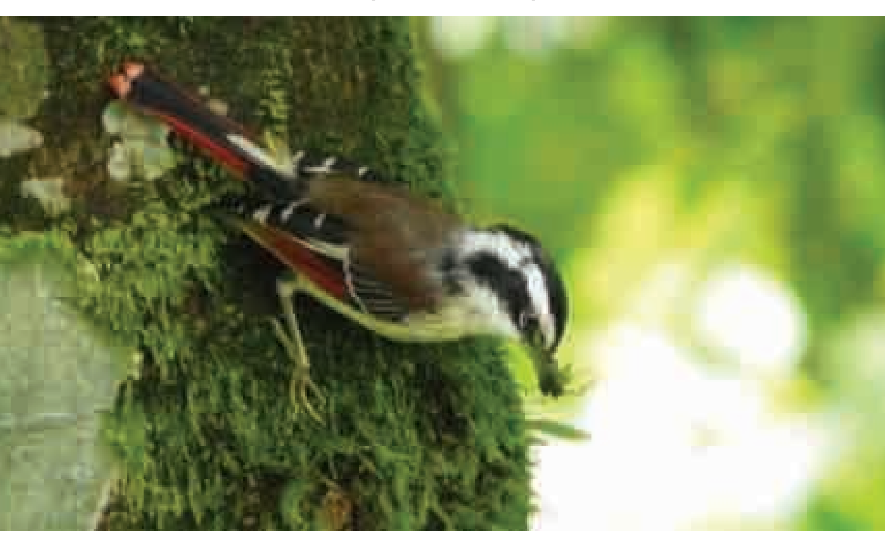
Red-tailed Minla Minla ignotincta : An altitudinal migrant in Sikkim. Prefers moist forest along the river valleys

KEYWORDS : Birds , elevation zone , endemic species , Sikkim , threatened species .