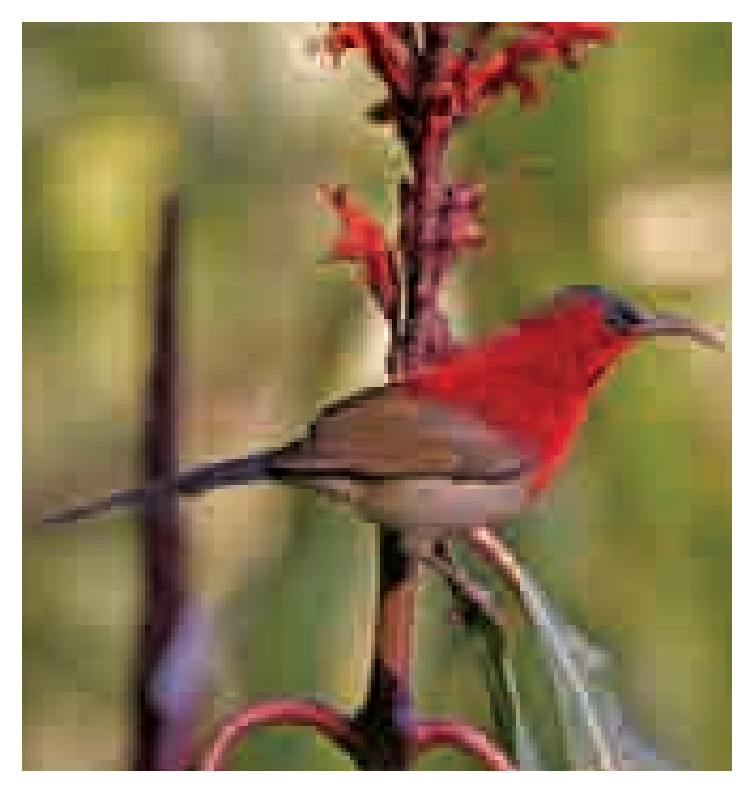
Crimson Sunbird Aethopyga siparaja : A very beautiful bird species of the low elevation forest in Sikkim. Feeds on nectar with its long pointed beak.