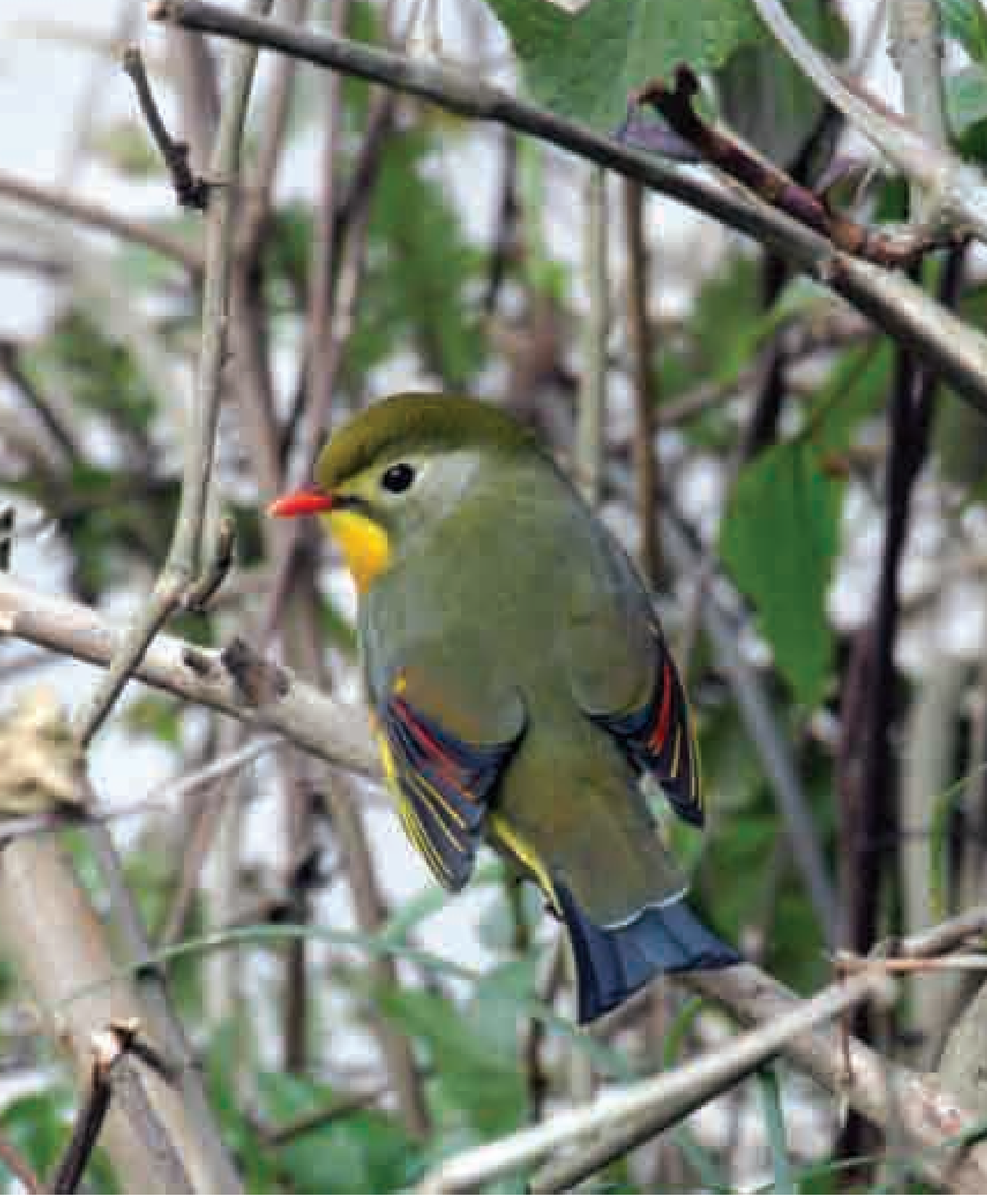
Red-billed Leiothrix Leiothrix lutea : Denizen of the secondary forest and ravines, commonly observed between 1000 to 3000 meters in Sikkim. Sociable and moves in mixed flocks.