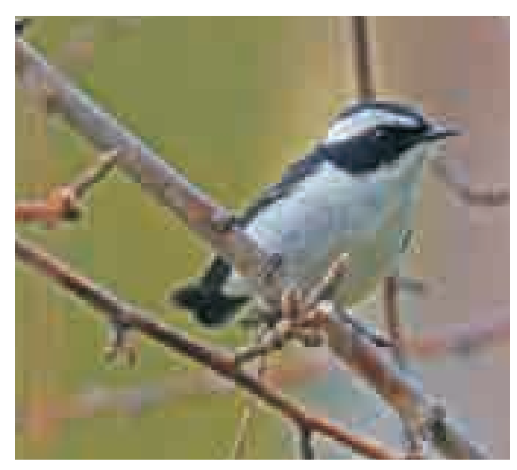
Little Pied Flycatcher Ficedula westermanni : Smallest among the flycatchers, Little Pied Flycatcher is a resident breeder of sub-tropical and temperate forests in the eastern Himalayas