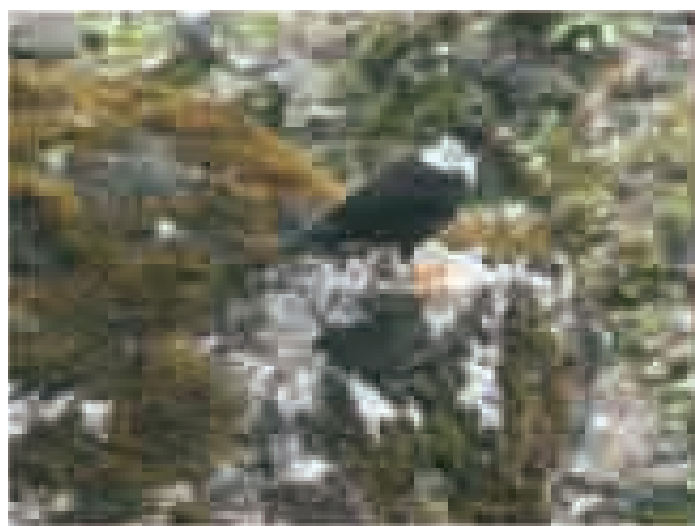
White-collared Blackbird Turdus albocinctus : A high elevation thrush commonly observed above 3000 meters. Its hard chuckling sound attracts the attention of the observer