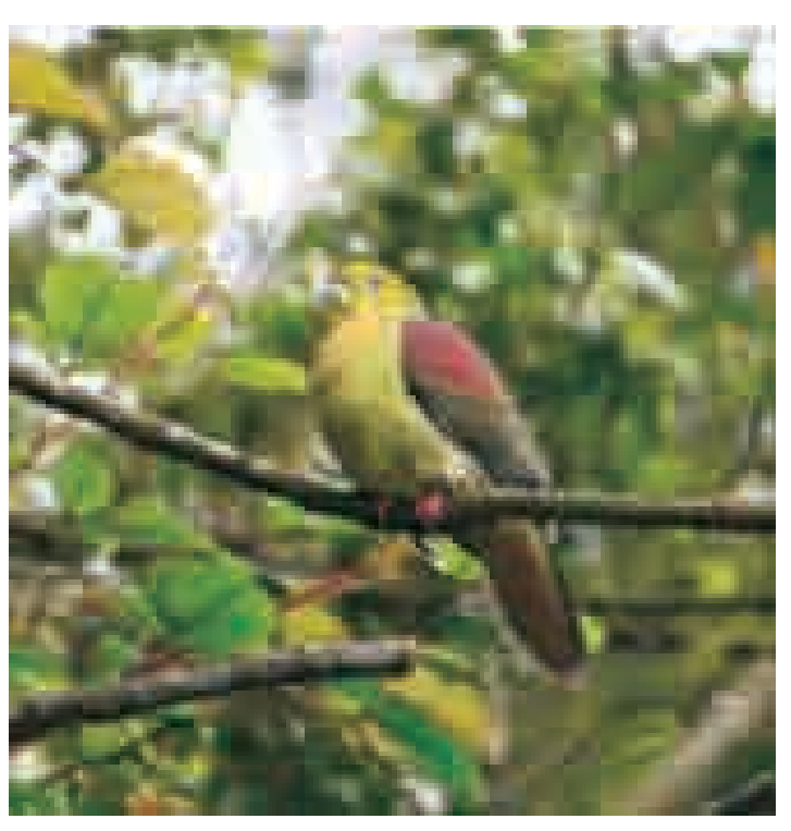
Wedge-tailed Green Pigeon Treron sphenura : It is an arboreal fruit pigeon commonly observed in the forest between 600 to 1500 meters elevations in Sikkim