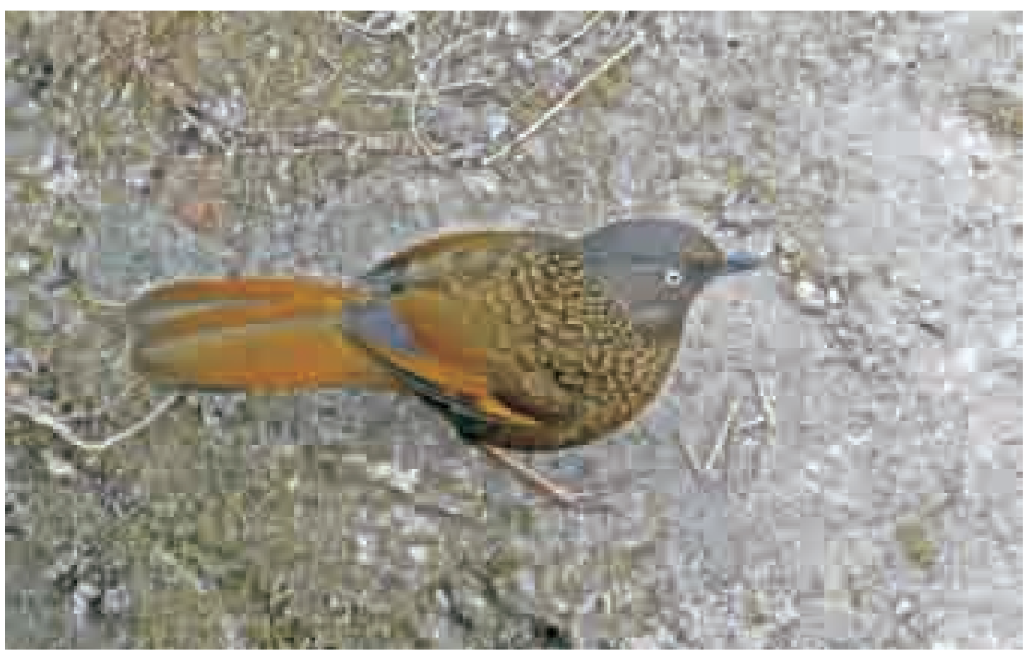
Scaly Laughingthrush Garrulax subunicolor : A rarer among the fifteen species of Laughingthrushes that occur in Sikkim. Inhabits undergrowth in moist temperate forests and Rhododendron shrubberies in the Himalayan region