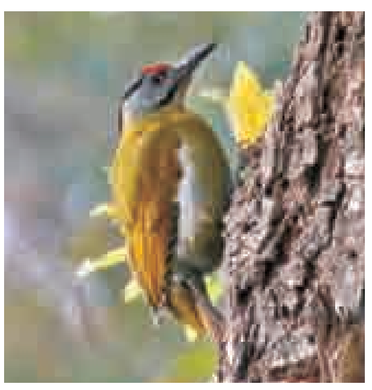
Grey-headed Woodpecker Picus canus : It lives in leaf forests and mixed forests mostly below 2000 m. It pecks maggots, beetle larvae and other insects from the tree barks or tree holes