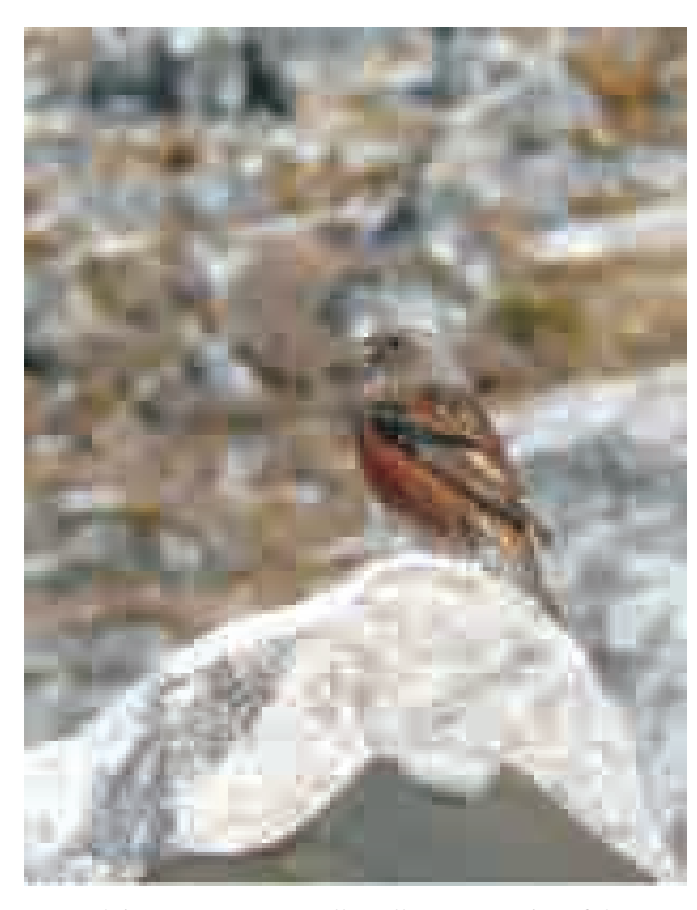
Alpine Accentor Prunella collaris : A species of the alpine region. Prefers open meadows and rocky pastures in the Himalayas