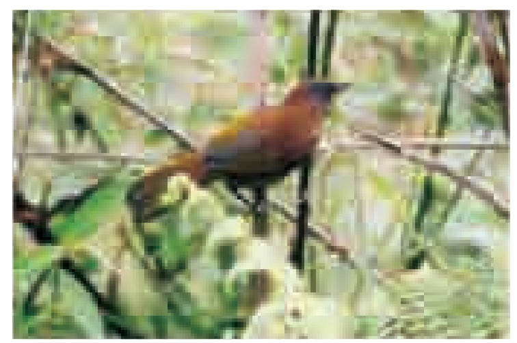
Chestnut-crowned Laughingthrush Garrulax erythrocephalus : Common among the Laughingthrushes. Found in shrubby undergrowth in the temperate broadleaved forest and coniferous forest