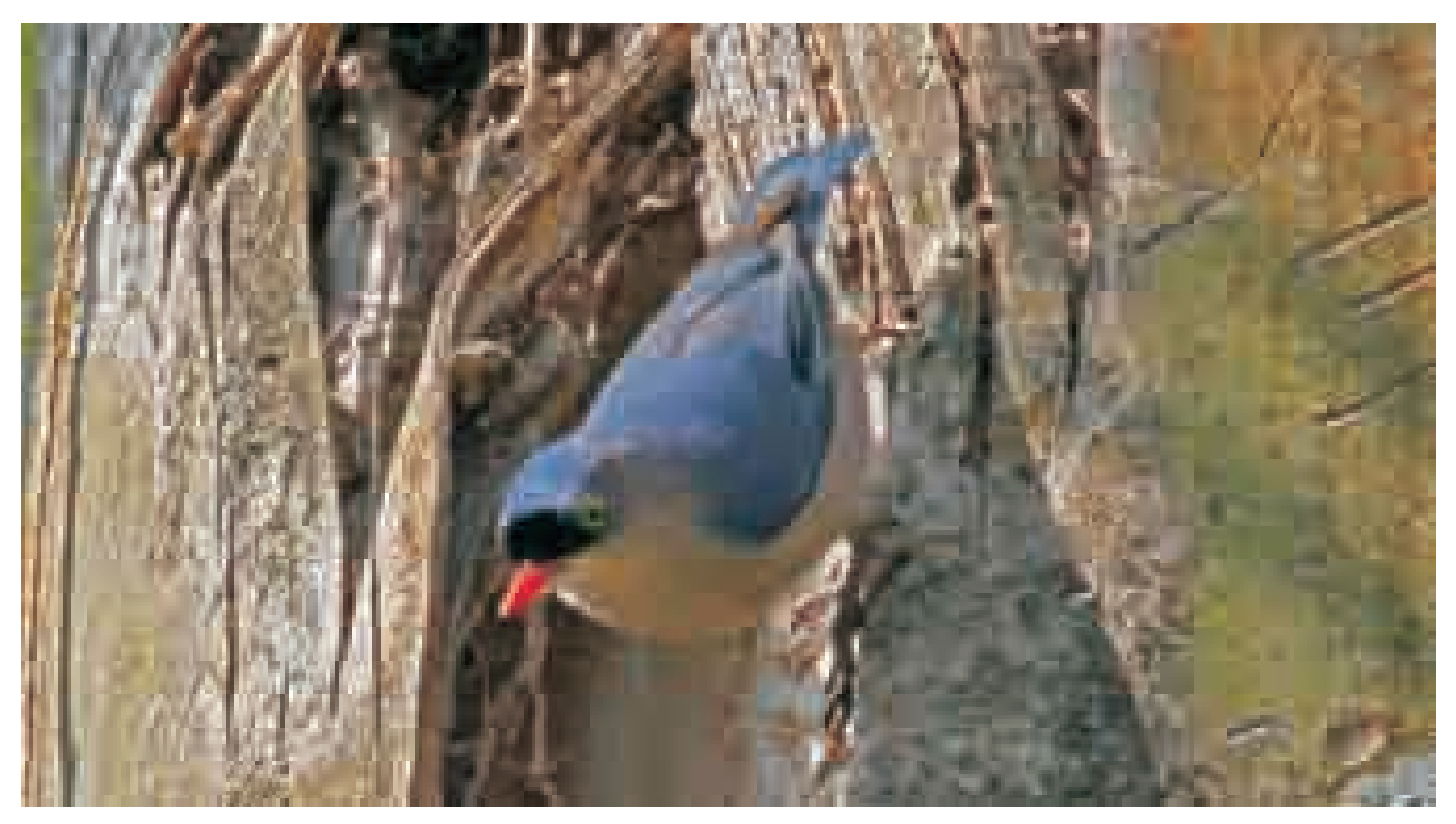
Velvet -fronted Nuthatch Sitta frontalis : A beautiful small short-tailed songbird with strong feet and a sharp beak. It feeds on small nuts, and insects from the tree barks. Found in forests and forest edges near human habitation in Sikkim up to 2000 m elevation