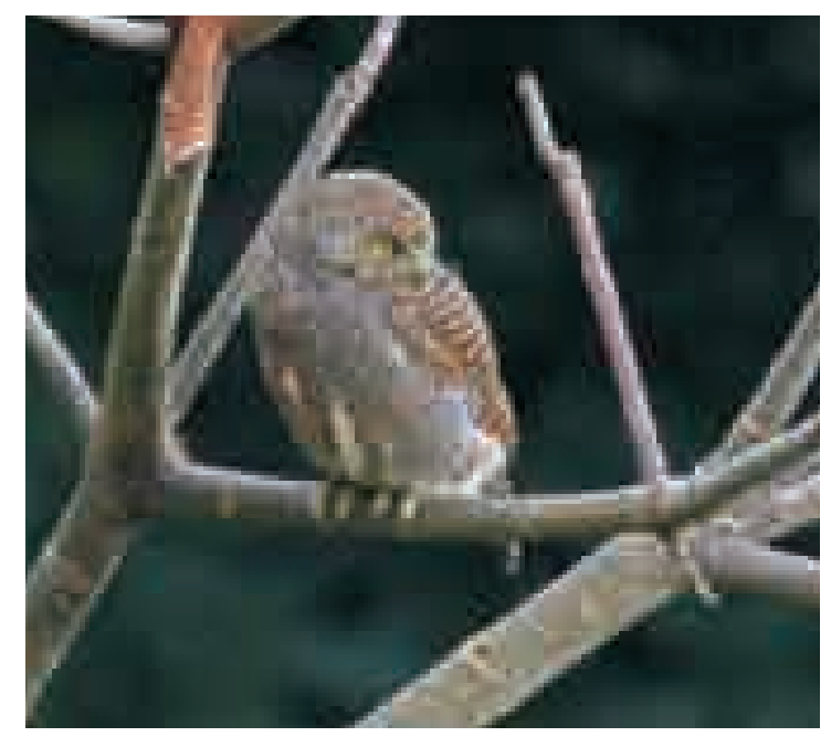
Asian Barred Owlet Glaucidium cuculoides : Common among the owls, seen along low to mid-elevation areas in Sikkim. Inhabits forest edges near human habitation