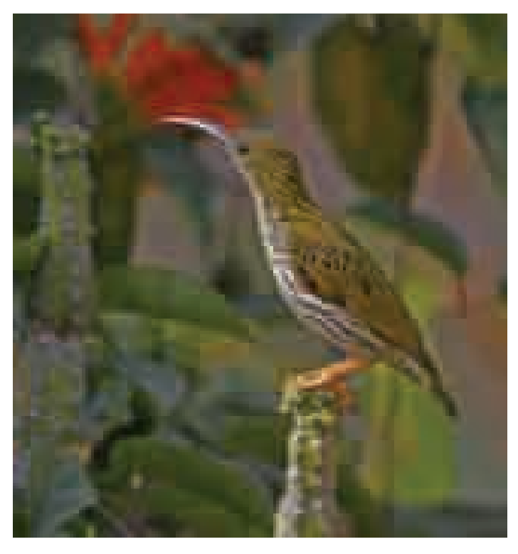
Streaked Spiderhunter Arachnothera magna : A rare bird with a unique beak. A low to mid-elevation species, that occurs in tropical forests having wild banana plants.