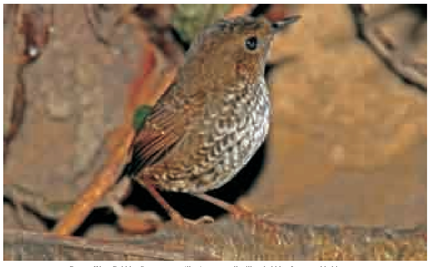
Pygmy Wren Babbler Pnoepyga pusilla : A very small tailless babbler. Its natural habitats are undergrowth of subtropical or tropical moist lowland forests or moist montane forests