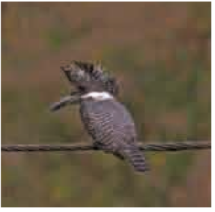
Crested Kingfisher Megaceryle lugubris : a rare Kingfisher species found in the lower valleys in Sikkim along the streams and rivers.