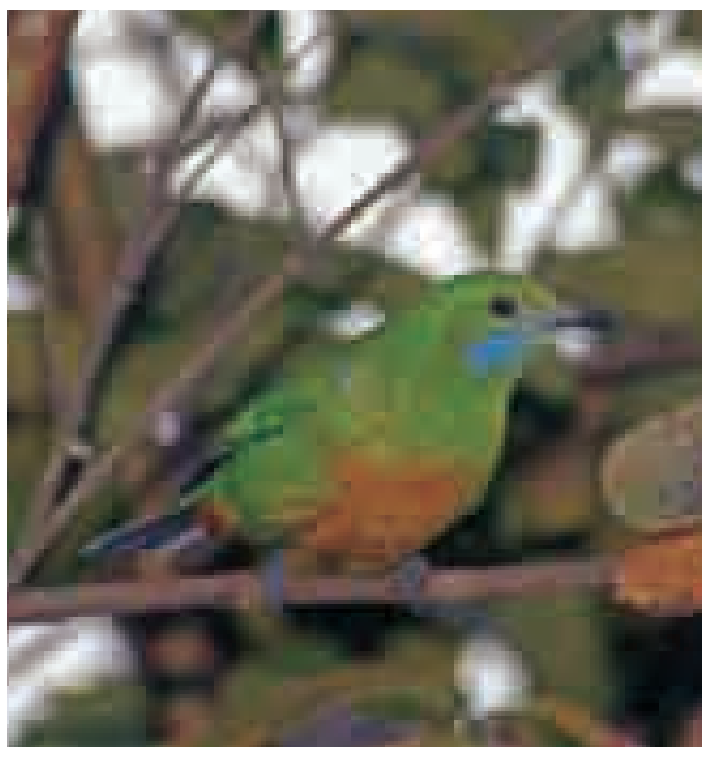
Orange-bellied Leafbird Chloropsis hardwickii : This bird is a native to the eastern Himalayas and south China to the Malay Peninsula. Inhabits tropical and sub-tropical forests in Sikkim