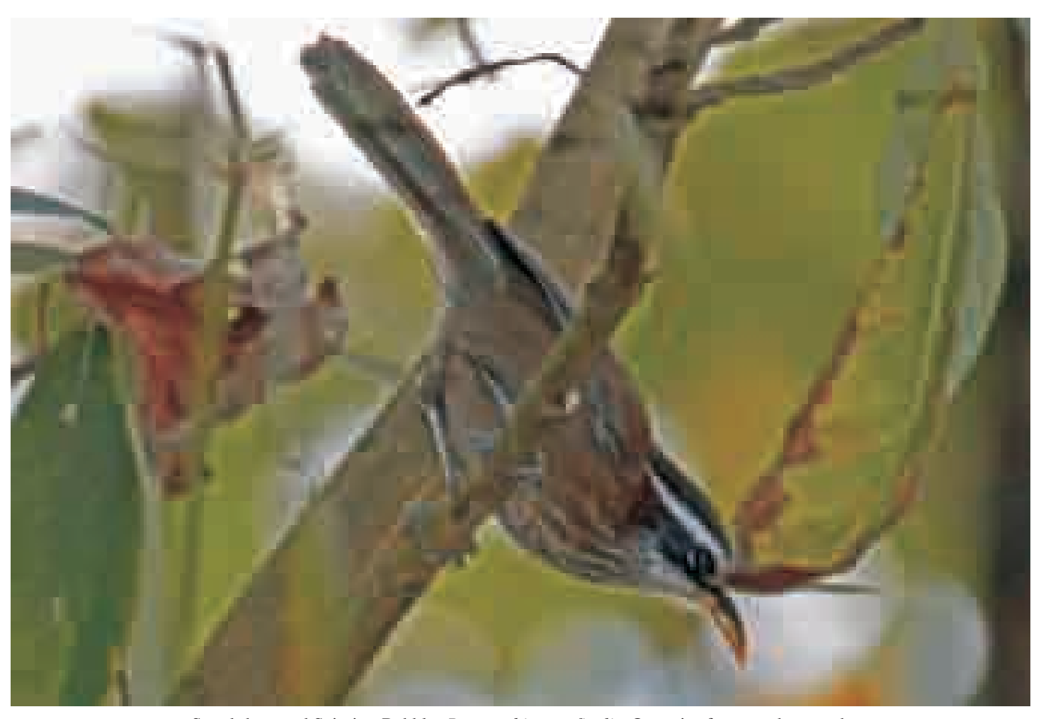
Streak-breasted Scimitar Babbler Pomatorhinus ruficolis : Occupies forest undergrowth and dense scrub from tropical to temperate forests mostly below 2000 m