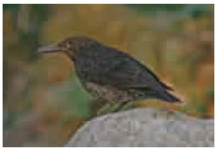
Long-billed Thrush Zoothera monticola : A thrush with huge bill and short tail. It inhabits Rhododendron undergrowth of mixed moist dense forest, mostly above 2500 m.