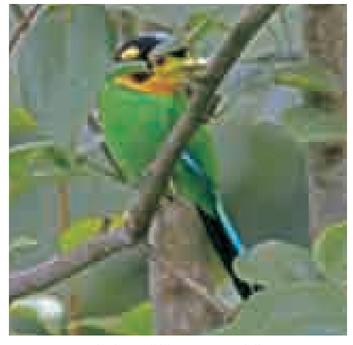
Long-tailed Broadbill Psarisomus dalhousiae : Beautiful species normally moves in noisy parties except during the mating season. Found in broadleaved forests (900-1800 m) in Sikkim but descends down to tropical belt (up to 300 m) during winter