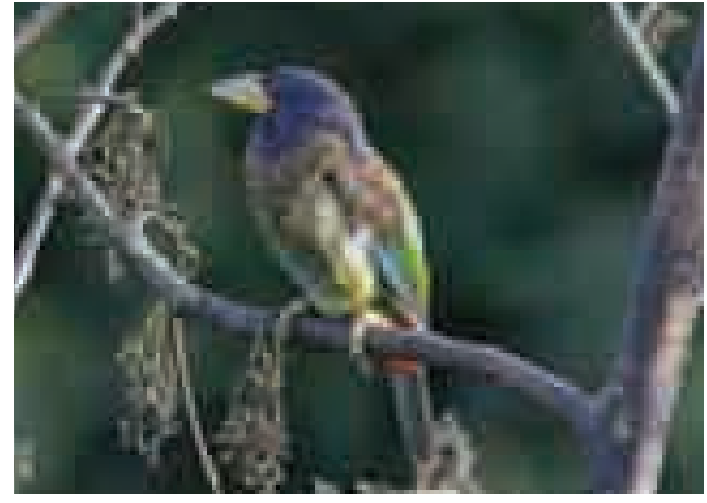
Great Barbet Megalaima virens : Frugivorous bird found from low to mid-elevation (upto 2000 meters) forest along the river valleys in Sikkim. Commonly known as ' Nyahul ', Great Barbet is the largest among all the barbets. A canopy species but its presence cannot be escaped because of its loud call.