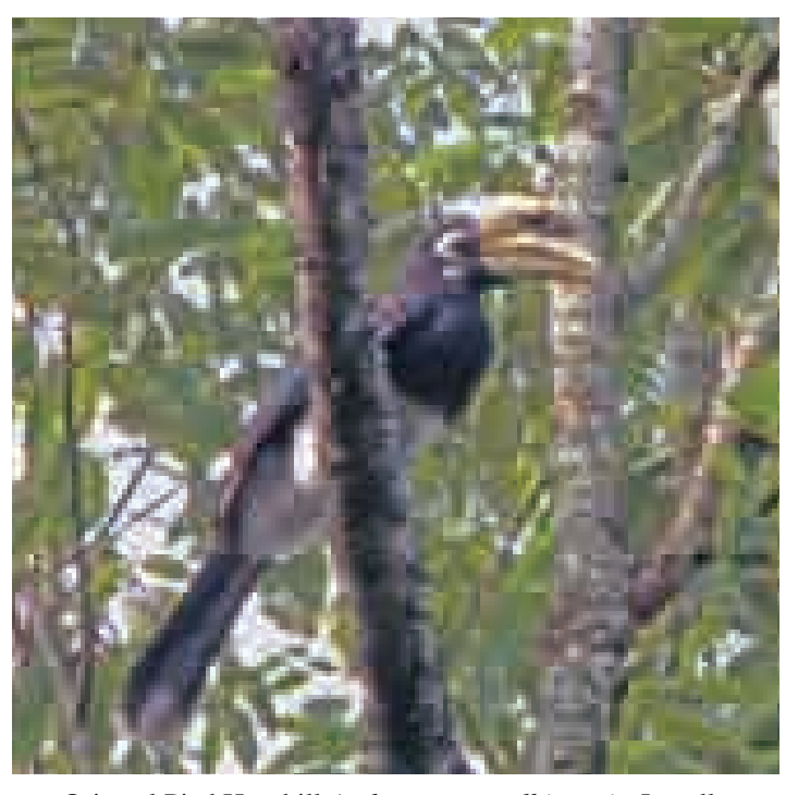
Oriental Pied Hornbill Anthracoceros albirostris : Locally called 'Hangrayo', it is a large bird with a gigantic beak and a cylindrical casque. Mostly feeds on Figs, it is found in low elevation forests in Sikkim