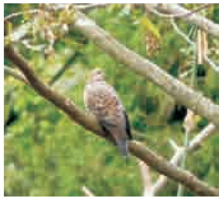
Oriental Turtle Dove Streptopelia orientalis : An altitudinal migrant, breeds in high elevation but descends down as low as 300 meters in winter. Found in open habitat near cultivation and forest edges