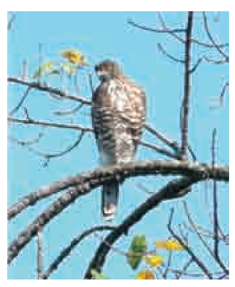
Besra Accipiter virgatus : Raptor of the dense broadleaved forest in Sikkim