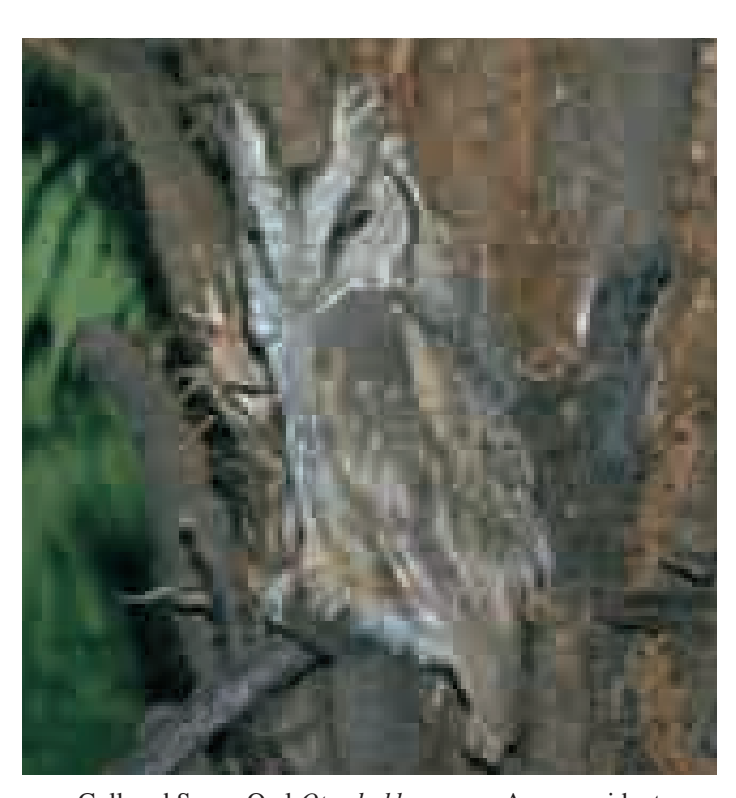
Collared Scops Owl Otus bakkamoena : A rare resident of tropical and subtropical forests in Sikkim, this owl is a resident breeder in South Asia. One can notice a wonderful camouflage of bird with the microhabitat that escapes the eye of an observer