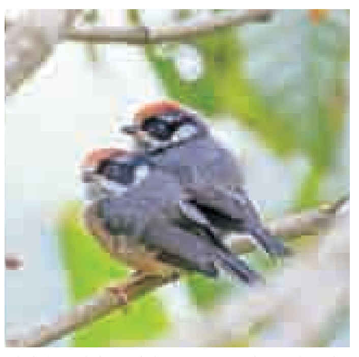
Black-throated Tit Aegithalos concinnus : Undergrowth species of temperate forests in Sikkim. Moves in a large flock along with other tits, warblers and smaller parrotbills