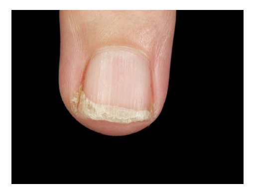
Fig 3. Severe brittle nails: severe lamellar splitting (grade 3) and moderate longitudinal ridges (grade 2), longitudinal splitting (grade 2), and moderate thickening (grade 2).

which is characterized by lamellar splitting of the free edge and distal portion of the nail plate. The severity of lamellar splitting may vary from mild parallel furrows of the superficial layers of the back surface of the nail plate at the distal free edge to severe lamellar splitting of the complete free edge and at least one third of the distal part of the nail plate. Proposed grades of severity of lamellar splitting are given in Table III. Onychoschizia may also include breaking of the lateral edges, causing transverse splitting. The severity of transverse splitting may vary between a single, superficial horizontal split of the nail plate to multiple horizontal splits leading to loosening of at least one third of the distal nail plate (Table IV).