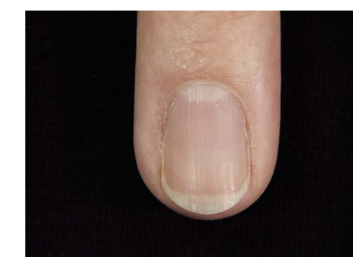
Fig 1. Mild brittle nails: mild distal lamellar splitting (grade 1) and mild longitudinal ridging (grade 1).

As vascularization and oxygenation directly affect epidermal growth and keratinization, arteriosclerosis and age-related decrease of circulation, microangiopathy, Raynaud's disease, anemia, polycythaemia vera (polycythaemia causing sludge formation),<sup>18,19,28,32-34</sup>