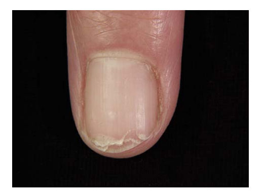
Fig 2. Moderate brittle nails: moderate lamellar crenellated splitting (grade 2), moderate longitudina, ridging (grade 2) and longitudinal splitting (grade 2), moderate thickening of nail plate (grade 2).