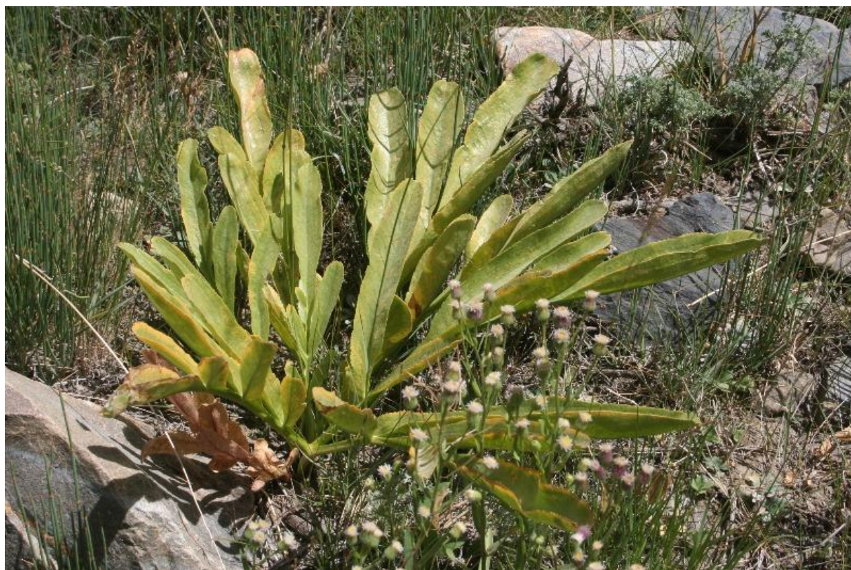
Figure 3. Ferula narthex Boiss.