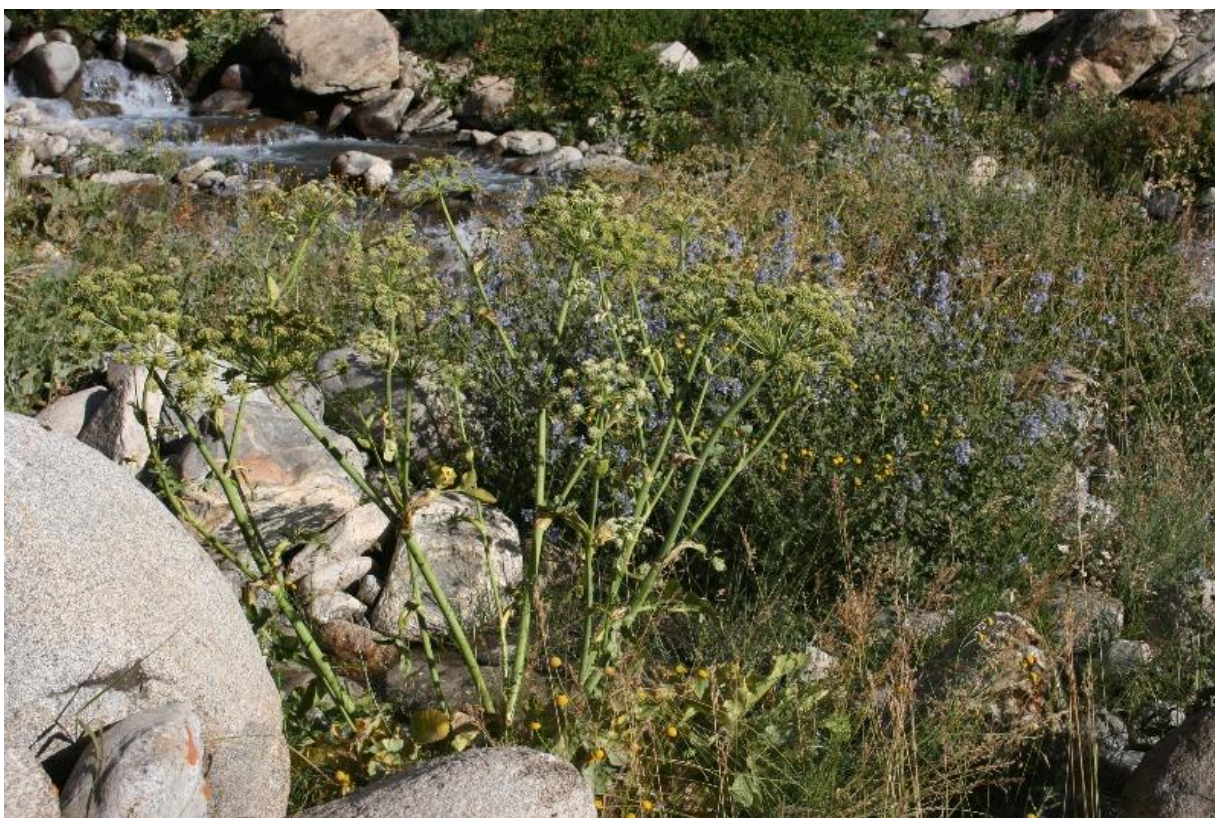
Figure 2. Angelica komarovii (Schischk.) V.N.Tikhom.

Our collections: Afghanistan, Badakhshan, 20 km SW of Sultan-Ishkashim on the road to