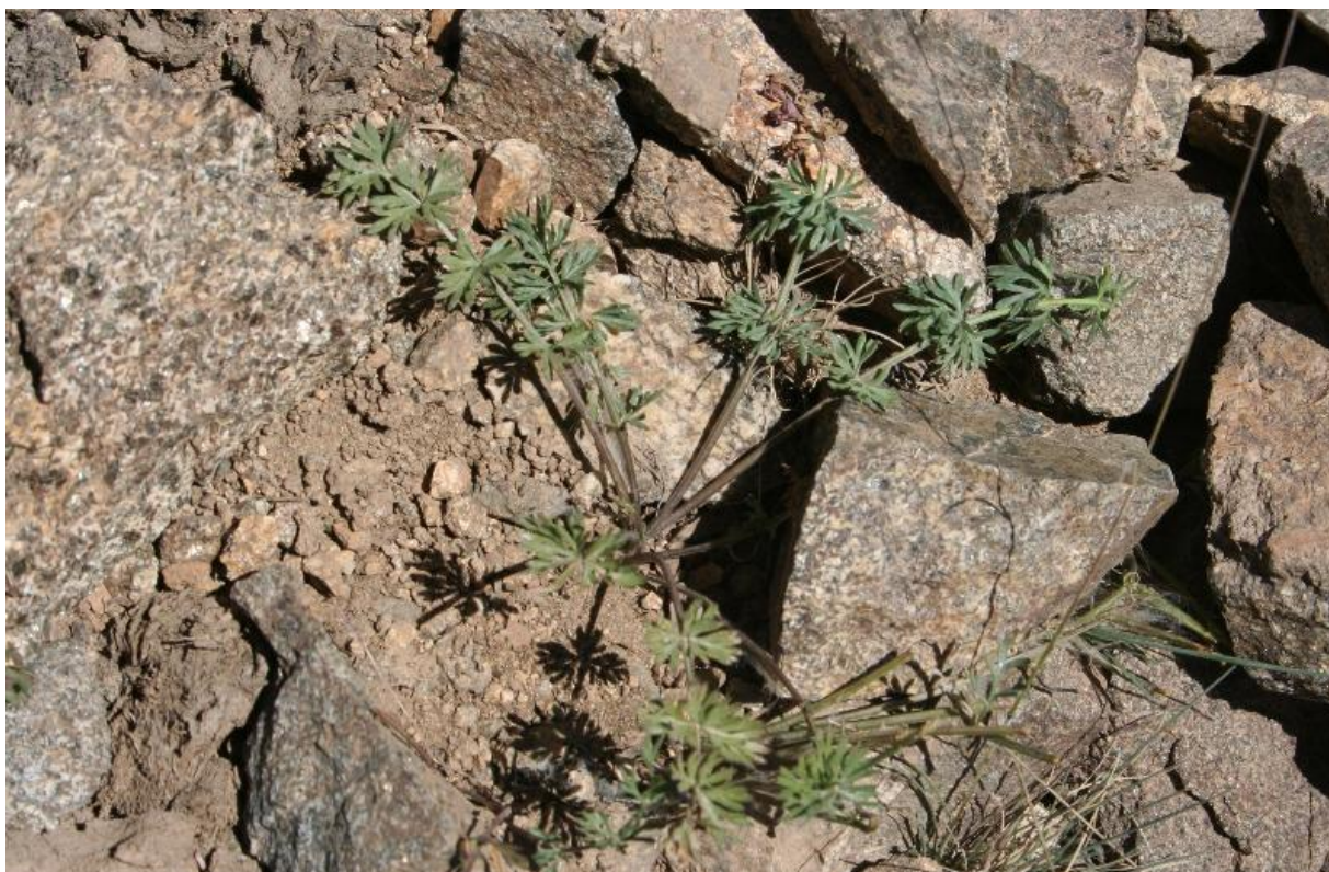
Figure 4. Lomatocarpa steineri (Podlech) Pimenov

Typus: NE Afghanistan, ‘prov. Kapisa, Oberes Panjir-Tal, Passhöhe am Übergang von Kur-Petau in das obere Dekhawak-Tal. 3800 m, 19.VIII.1965, Podlech 12497 ’ (holotype M!; isotypes G!, W!).