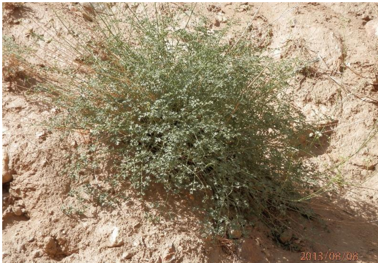
Figure 5. Seseli afghanicum (Podlech) Pimenov

Our collection: Afghanistan, Badakhshan, valley of the Pyandj River, Zuvardara rivulet near the mouth, stony slope, 37°08.89'N, 71°26.36'E, 2330 m, 08.VIII.2013, 81.