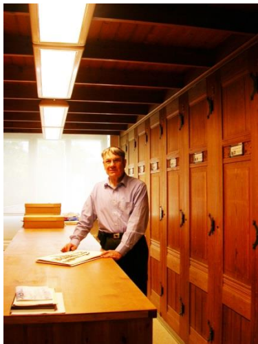
In the herbarium, Helsinki