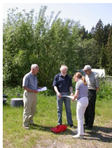
At a willow plantation near Helsinki