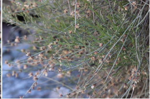
Figure 5. Prunus arabica (Olivier) Meikle hanging from rock in upper part of stony gorge with dry spring.