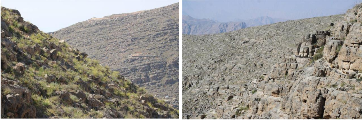
Figure 1. Rocky ledges and stony slopes in high mountains near the border with Oman.