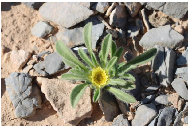
Figure 8. Senecio coronopifolius Burm. f. on rocky ledges.