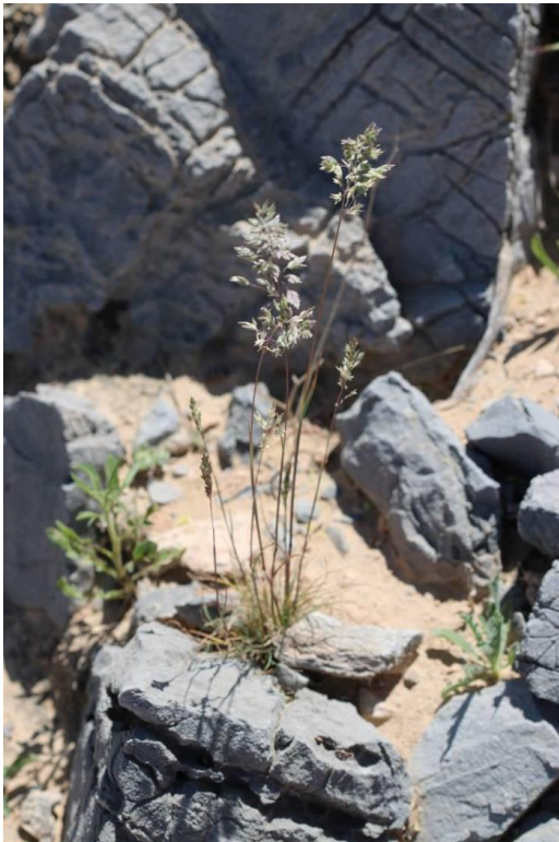
Figure 15. Poa sinaica Steud. on rocky ledges with silt.

This species is very similar to Poa bulbosa but differs by the following features (based on Bor, Flora of Iraq , 1968: 110; Ali et al. , Flora of Pakistan , 1982: 401, Cope, 2021): lemmas 2–3 mm long, callus with at least a few strands of wool, spikelets ovate-oblong, 3–6 mm long, in P. bulbosa and lemmas 3.5–4.5 mm long, callus without wool, spikelets in P. sinaica spikelets oblong-elliptic, 6–8 mm long.