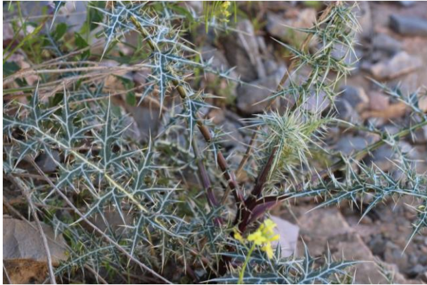
Figure 4. Echinops erinaceus Kit Tan in upper part of stony gorge with dry spring.

Along with Artemisia sieberi some other rare plants grow on the plateau and on ledged rocky slopes, such as Crepis kotschyana (Boiss.) Boiss. (see below), Echinops erinaceus Kit Tan (Fig. 4), Prunus arabica (Olivier) Meikle ( Amygdalus arabica Olivier) (Fig. 5), Pallenis hierochuntica (Michon) Greuter (Fig. 6), Jurinea berardioides (Boiss.) O.Hoffm., Anthemis odontostephana Boiss., Jurinea carduiformis (Jaub. & Spach) Boiss. (Fig. 7), Farsetia aegyptia