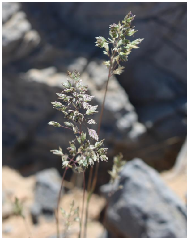
Figure 16. Spikelets of Poa sinaica Steud.