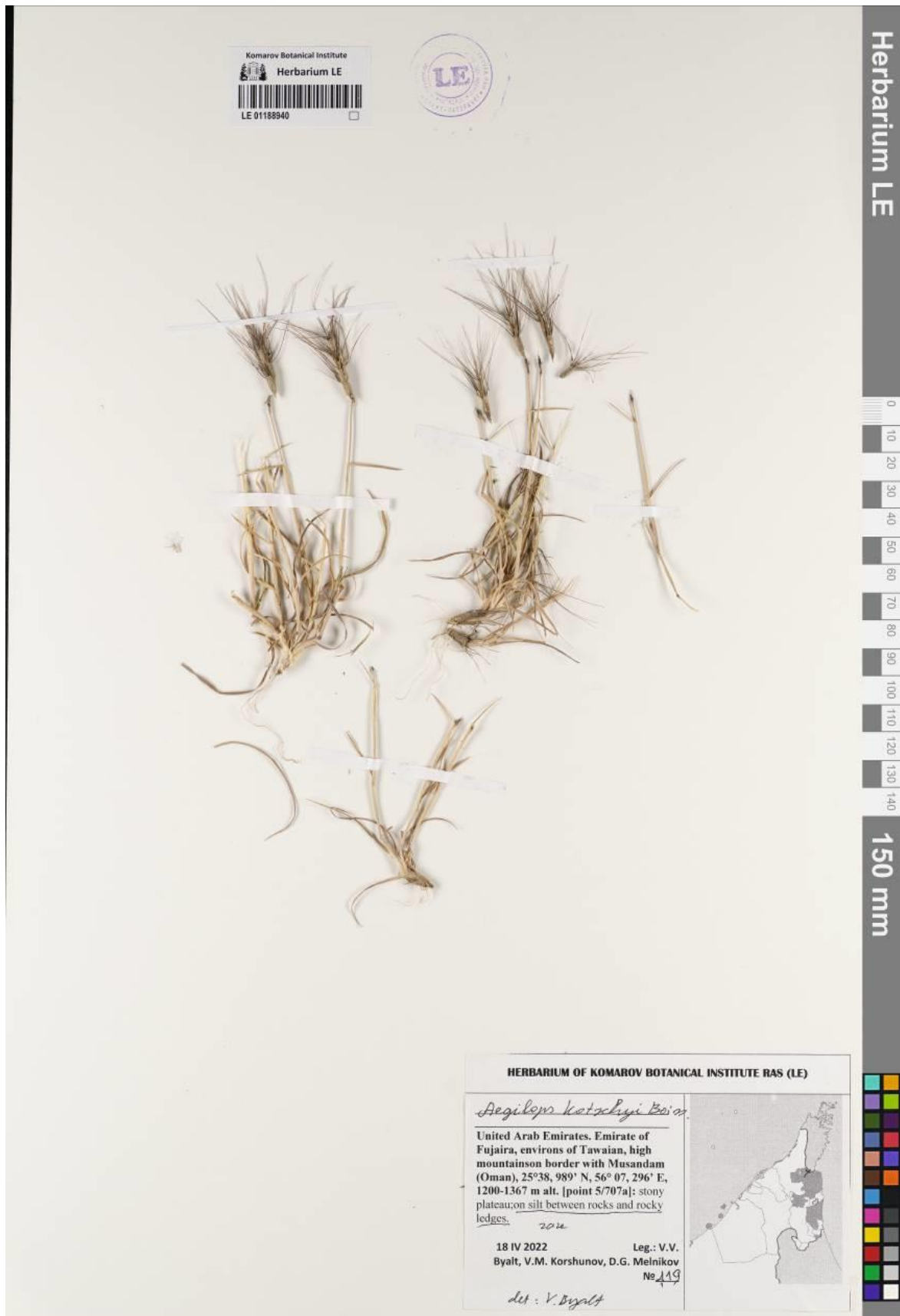
Figure 14. Scanned herbarium specimen of Aegilops kotschyi Boiss. var. hirta Eig at LE (LE01188940).