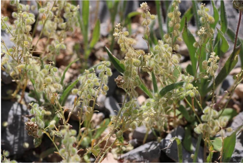
Figure 12. Clypeola asperata (Weber) Turill on rock ledges in high mountain near Al Tawyeen.

Distribution in UAE: Fujairah Emirate, Al Tawyeen (Taween) area, small village 0.8 km west-north-west of the mountain peak, 25°38'59.41"N, 56° 7'17.88"E, elevation 1200–1360 m, on rock ledges, 13.III.2020, V.V. Byalt, M.V. Korshunov 370, fl., fr. (LE!). (Fig. 12).