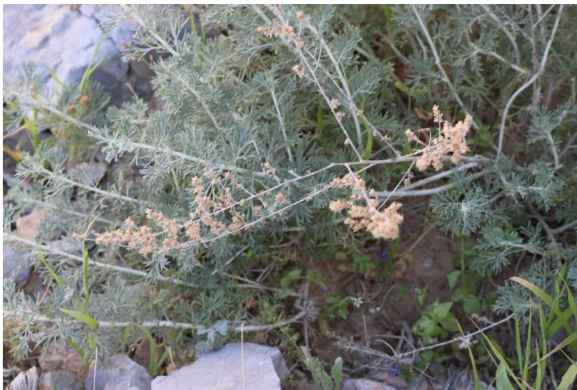
Figure 3. Artemisia sieberi Besser on rock ledges and stony slopes in high mountains near Al Tawyeen.

– Seriphidium herba-alba auct. non (Asso) Soják, Čas. Nár. Muz., Rada Přír. 152: 22. 1983: Rawi, Dep. Agr. Tech. Bull. 14: 106. 1964.