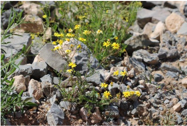
Figure 6. Pallenis hierochuntica (Michon) Greuter on plateau.