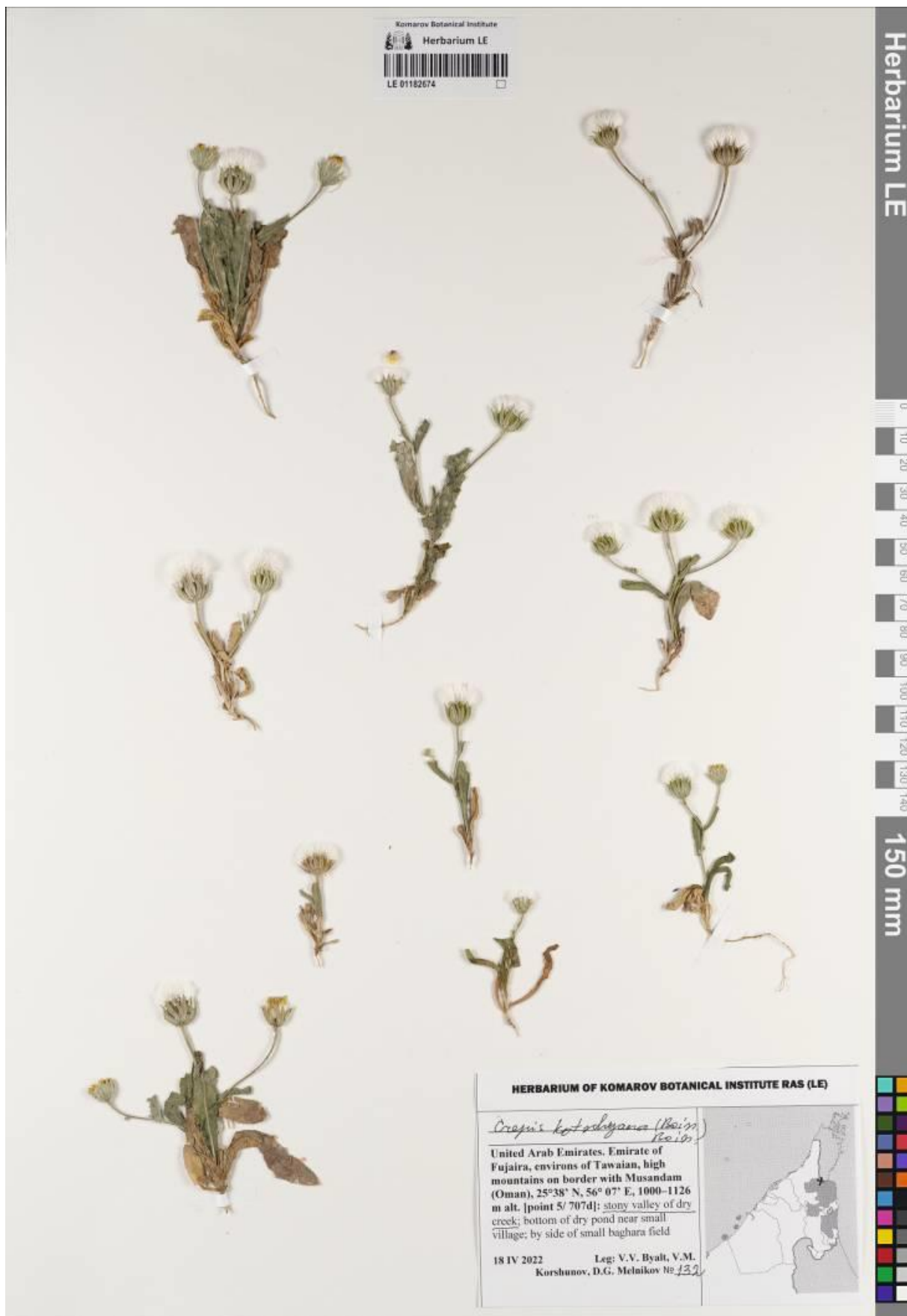
Figure 9. Scanned herbarium specimen of Crepis kotschyana (Boiss.) Boiss. at LE (LE 01182674)