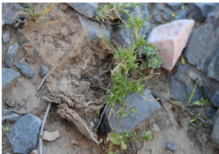
Figure 13. Young plant of Velezia fasciculata Boiss. between stones (in centre) together with Anagallis arvensis L. and Filago desertorum Pomel.

Our plants match the herbarium specimens of Velezia fasciculata at JSTOR (2022), the specimens of V. fasciculata at POWO (2022), in LE, and the original description of V. fasciculata given by Boissier (1849), as well as a description V. fasciculata given in Flora of Turkey (Coode, 1967).