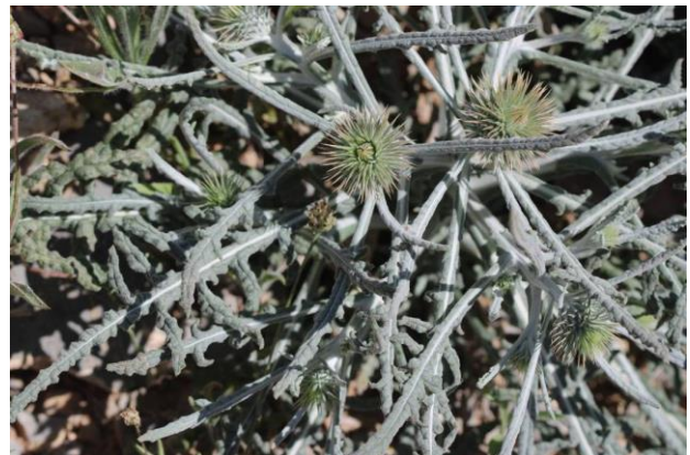
Figure 7. Jurinea carduiformis (Jaub. & Spach) Boiss. on rocky ledges.