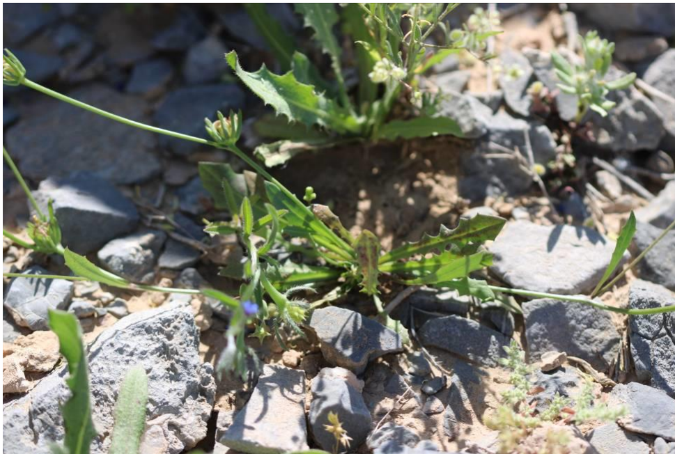
Figure 10. Garhadiolus hedyinois Jaub. & Spach on rocky ledges with silt.

Distribution worldwide: Afghanistan, Cyprus, Egypt, Iran, Iraq, Kazakhstan, Kirgizstan, Lebanon-Syria, North Caucasus, SW Oman, Pakistan, Israel/Palestine, Saudi Arabia, Sinai,