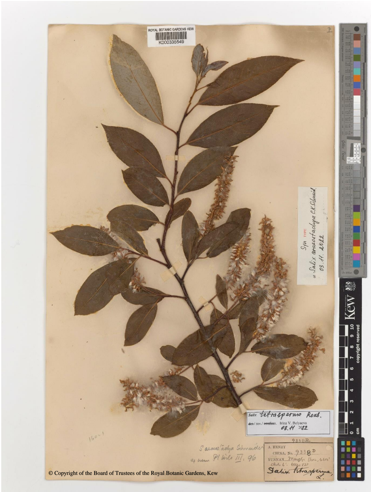
Figure 6. Epitype of Salix araeostachya C.K.Schneid. ( http://species.kew.org/herbarium/K000335549 )