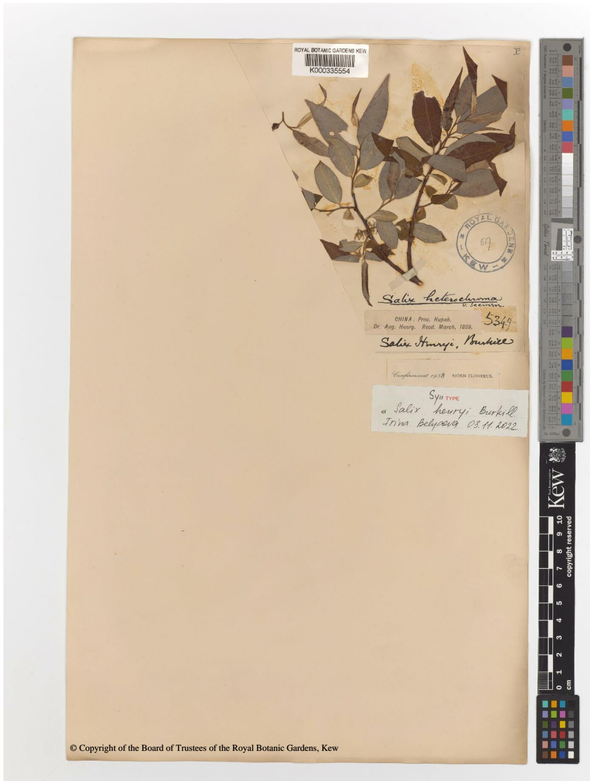
Figure 4. Syntype of Salix henryi Burkill ( http://species.kew.org/herbarium/K000335554 )