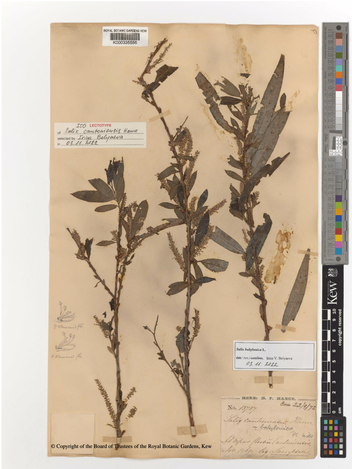
Figure 1. Isolectotype of Salix cantoniensis Hance ( http://species.keew.org/herbarium/K000335556 )