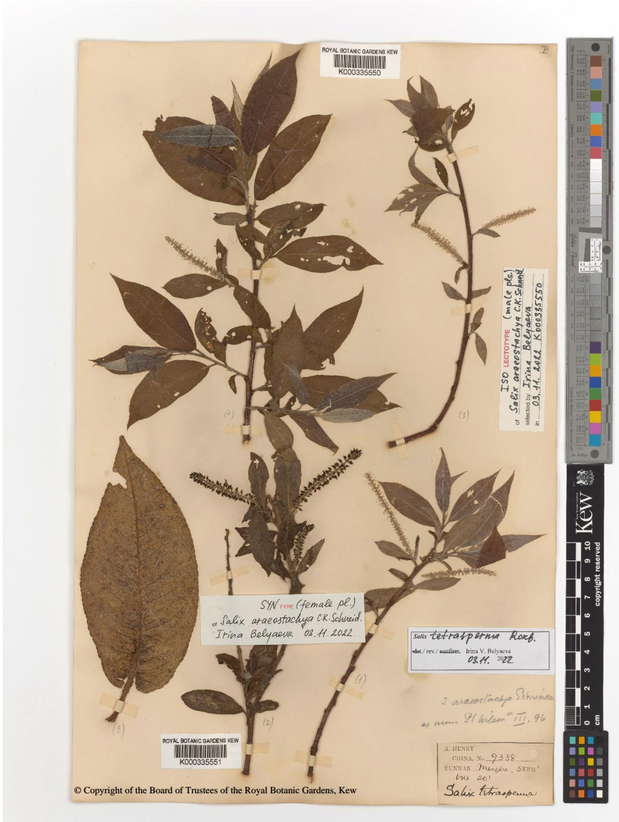
Figure 5. Isolectotype of Salix araeostachya C.K.Schneid. ( http://species.kew.org/herbarium/K000335550 )