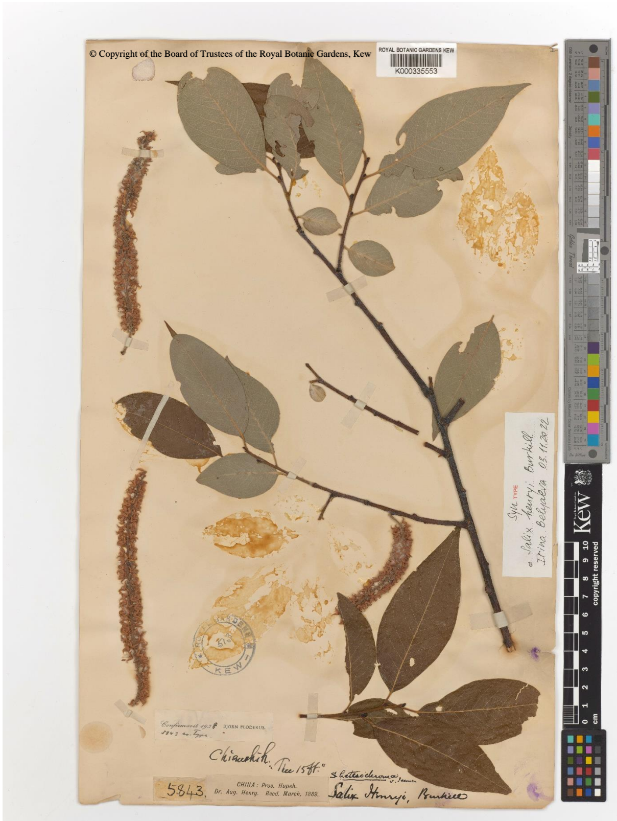
Figure 3. Syntype of Salix heteromera Seemen and S. henryi Burkhill http://species.kew.org/herbarium/K000335553