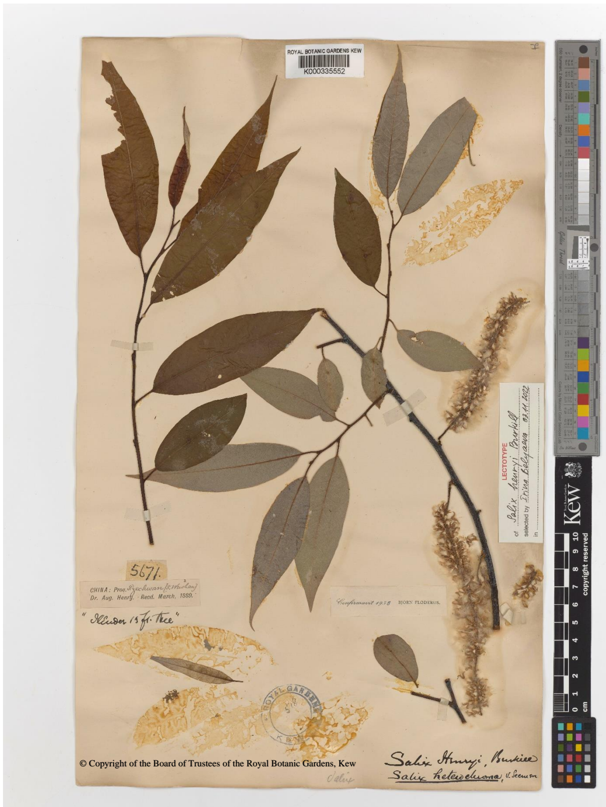
Figure 2. Lectotype of Salix heteromera Seemen and S. henryi Burkill http://species.kew.org/herbarium/K000335552