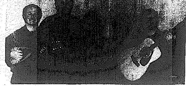
ABBEYSIDE/BALLINACOURTY-BALLAD GR OUP — ALL-IRELAND SCOR CHAMPIONS

They won three games (hurling) to reach the semi-final, before being beaten by Wexford in the final they beat Tipperary by three points.