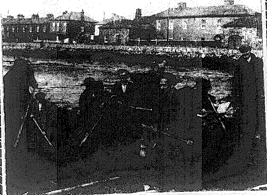
This is yet another photograph which looks back through the years in our new series 'Memories Of The Past.'

LAST WEEK'S PHOTO - Was taken at the old GIE Station in Dungarvan sometime in the mid-1950's and showed the engine of the daily goods train which ran between Waterford and Dungarvan and back in those days.