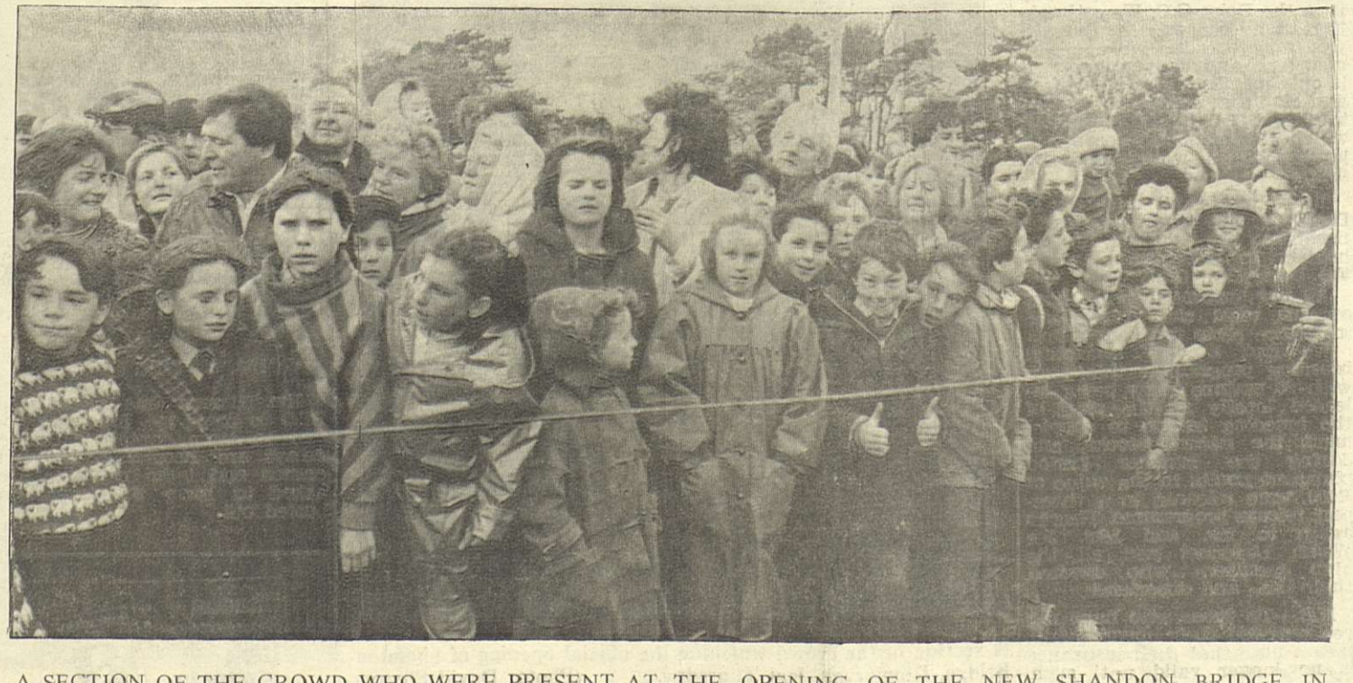
A SECTION OF THE CROWD WHO WERE PRESENT AT THE OPENING OF THE NEW SHANDON BRIDGE IN