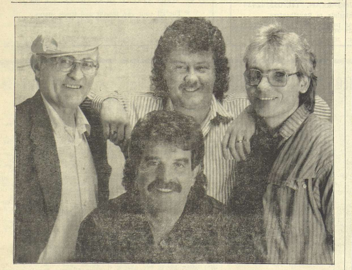
The renowned Dublin City Ramblers who are appearing at Barton's, The Pike on this Saturday night, November 7.