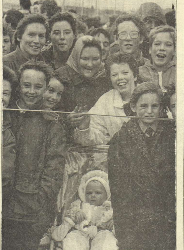
A section of the crowd watching the official opening of Shandon Bridge, Dungarvan, last Thursday.

The Western Board will hold their final meeting of the year on this Thursday evening when matters arising from the referees report of the Stradbally/ Ballysaggart divisional hurling final will be dealt with. Follow-Sunday when they beat the hotly fancied Lismore in what has been described as a thrilling match. With the majority of the team which won the minor title three years ago, I