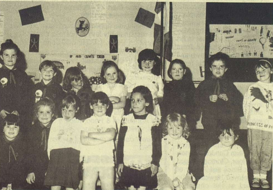
The newly formed Abbesside/Dungarvan Ladybird Unit pictured at their enrolment at Abbesside Scout Den on Friday night.