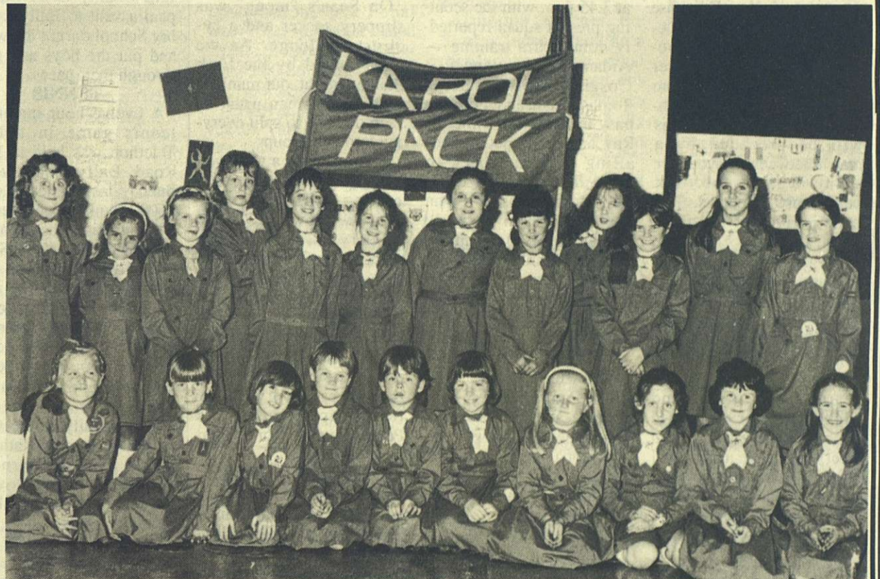
The Abbesside/Dungarvan Brownies pictured following their enrolment into the Brownie Pack at Abbesside Scouts Den, on Friday night.