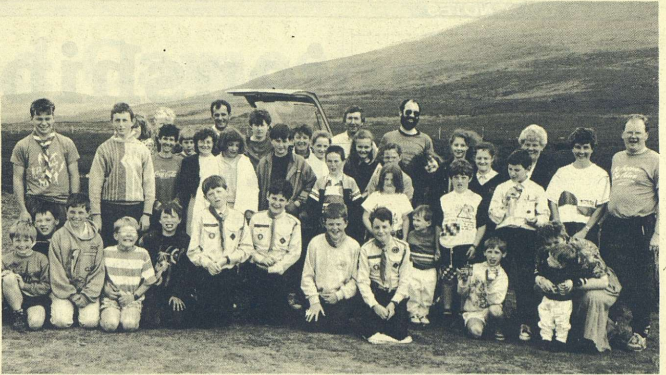
As part of "Be Active, Be Alive" Week, a walk was held up the Mauma Road. Picture includes some the participants and helpers who took part.