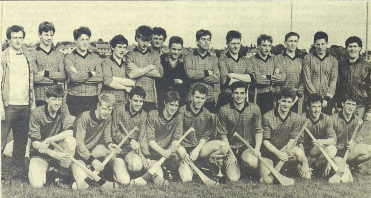
St. Augustine's College Dungarvan team, who beat Dungarvan C.B.S. in the Waterford Colleges senior hurling final at Fraher Field.