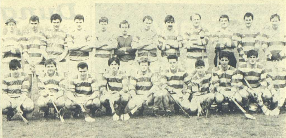
The Abbeyside team who defeated De La Salle in their Intermediate Hurling championship game at Kill.

Dancing continues on this Sunday night, May 20, for members and friends who are all welcome to come along. A good night assured.