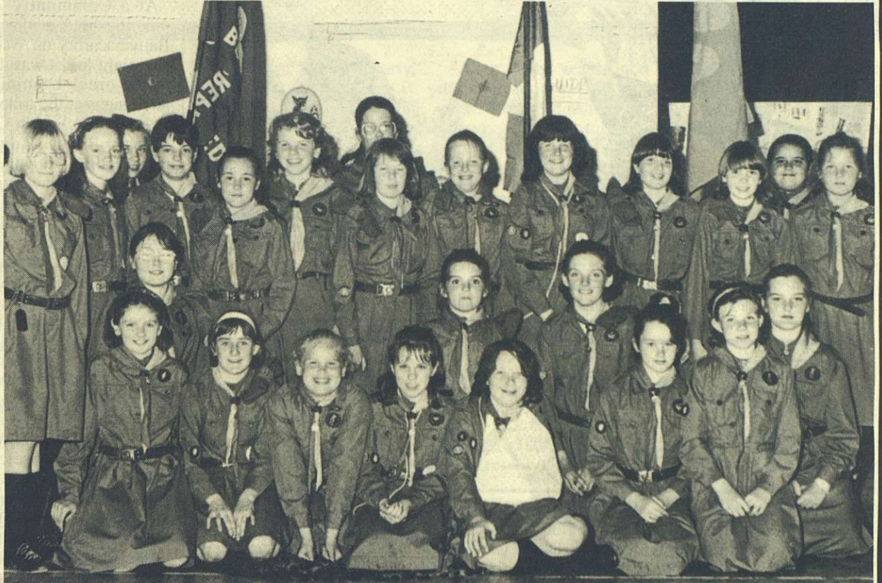
Pictured above are the Abbesside/Dungarvan Girl Guides after their enrolment into the Girl Guides Unit last Friday night at the Scouts Den, Abbesside.