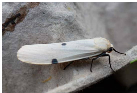
Female Four-spotted Footman