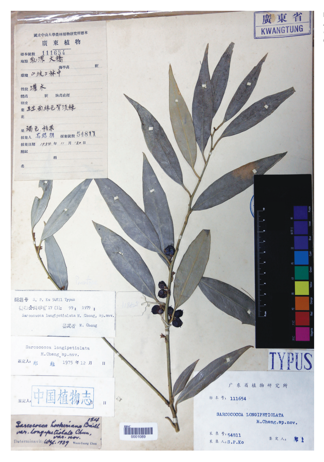
Fig. 2. Paratype of Sarcococca longipetiolata M.Cheng ( X.P. Gao 54811 , IBSC barcode 0001089).

From the internal evidence of Cheng (1979), a label with "Typus" term was posted on the sheet of two cited specimens (see pls. 8-1, 8-2). Currently, the "Typus" labels are still posted on the both sheets (no. 53542, barcode 0001088 [Fig. 1]; no. 54811, barcode 0001089 [Fig. 2]), while positions of labels have been changed. Please note that someone annotated the sheet 0001088