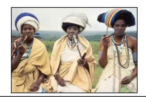
Traditional Xhoza women smoking their pipes

African farmers planted and ate sorghum and millet. This region was suitable for their crops as it received about 500mm of rain during the summer growing season.