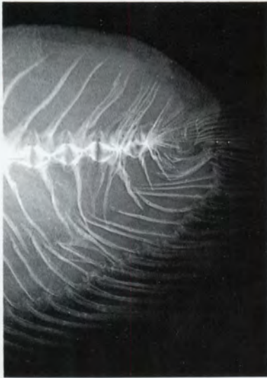
Figure 1. Radiograph of tail portion of Heteropneustes microps from Navinna (Galle: Southern Province), Sri Lanka, WHT 1323, 86.1 mm SL.