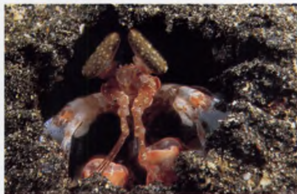
Figure 3. Lysiosquillina lisa sp. nov., (male paratype, AM P60075) at burrow entrance, Lembeh Strait, north Sulawesi, Indonesia, (J. E. Randall).