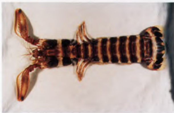
Figure 2. Lysiosquillina lisa sp. nov. holotype, dorsal view (J.E. Randall).