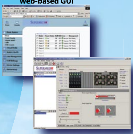
CMM IPMI View