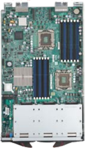
Tylersburg/Nehalem Storage Blade w/ 6 SAS2.0 HDD Support and QDR InfiniBand