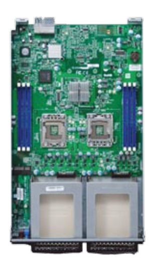
Tylersburg Cost-effective Blade