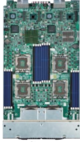
NEW! TwinBlade 2 DP Nodes in 1 Blade