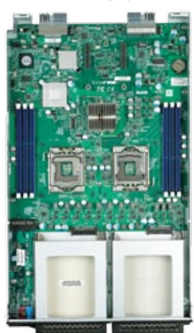
NEW! Tylersburg Cost-effective Blade with Dual GBX and InfiniBand