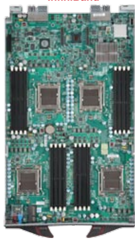
NEW! 4-way Opteron Blade featuring PCI-E 2.0 and QDR InfiniBand