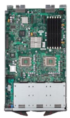
Power Saving, San Clemente 50dB OfficeBlade™