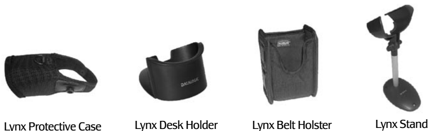
Lynx Protective Case