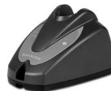
Base Station - Black