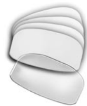
Replaceable Window Pack (5)