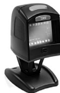
Shown with optional stand

The Magellan 1000i represents the newest breakthrough in data capture technology from Datalogic. The world's first imaging based presentation scanner, the Magellan 1000i is designed for convenience stores, drug stores, specialty stores and other medium volume checkout environments. The Magellan 1000i's solid-state construction with no moving parts increases reliability while the ultra-small size frees up valuable counter selling space. The Magellan 1000i excels at capturing hard-to-read bar codes in an omni-direction orientation and supports both presentation and sweep scanning styles. The Magellan 1000i also offers an optional targeted scanning mode for scanning close proximity bar codes like those on a pick list. Standard factory warranty is two years.