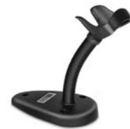
Gooseneck Stand (Black)