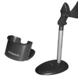
Heron G Stands