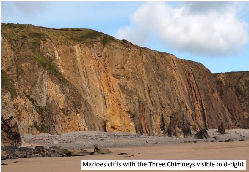
Marloes cliffs with the Three Chimneys visible mid-right

An easy footpath leads from the National Trust car park about half a mile down to a broad bay with spectacular cliffs. Tide permitting, you can walk along the beach to the furthest end of the bay. On a high tide there is very little access to the beach, but you can walk along the cliff top.