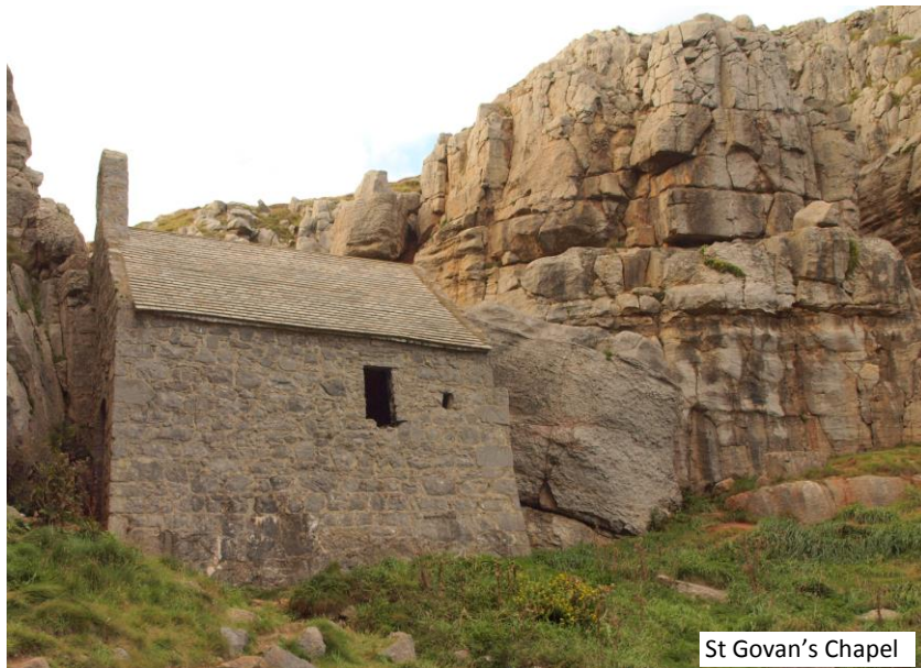
St Govan's Chapel