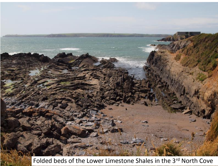
Folded beds of the Lower Limestone Shales in the 3 rd North Cove

The lower Conglomeratic Member is red coloured, with both sandstone and conglomerate horizons containing exotic clasts, as well as calcretes. Above this is the Heterolithic Member which trends upwards to a grey colour, and exhibits fining upward sequences and beds of macerated plant remains with occasional fish teeth and bivalves. Palynological dating gives an Upper Devonian age within the deep cleft next to a sea stack. However, the top beds on the sea stack are thin sandstones and interbedded shales which have been dated palynologically to the Tournaisian (Lower Carboniferous, Dinantian). The transition to fully marine Lower Limestone Shales is further above this, in the centre of the Third North Cove.