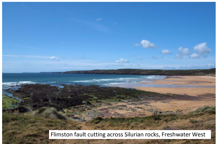
Flimston fault cutting across Silurian rocks, Freshwater West

This spectacular pair of beaches was used in 2010 for the filming of both Harry Potter and Robin Hood. The southern end is adjacent to the MOD firing ranges and many classic localities are now inaccessible. Depending on the current beach level some or all exposures may be buried by sand or pebbles. Park in the main car park and look at the nearest part of the beach before you descend. You may be able to see the line of the Flimston tear fault trending along the bay. Walk down to the most northerly exposed rocks at this end of the bay. If the beach level is very low you may be able to pick out some of the Ordovician Llanvirn Shale, or the overlying top few metres of the marine Silurian (Wenlock) Gray Sandstone Group (with pebble-sized conglomerates), overlain unconformably by cobble sized conglomerates of the Freshwater East Formation. As you walk southwards towards Little Furzenip (the sea stack), note the change to the fine-grained facies of red and green mudstones of the Moors Cliff Formation, including the thin Townsend Tuff Bed which marks the Silurian/Devonian boundary.