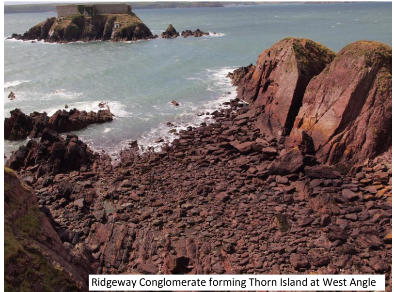
Ridgeway Conglomerate forming Thorn Island at West Angle

Walk along the coastal path to the north of the beach car park until you are at the closest point to Thorn Island. The island and the prominent red stack just offshore (at high tide) are formed of steeply dipping Devonian Ridgeway Conglomerate overlain by the Gupton Formation as seen at Freshwater West. The harder Ridgeway Conglomerate forms the prominent stack and island. Turn and head back along the coastal path looking for the Upper Devonian West Angle Formation which is a fluvial semi-arid flood plain deposit.