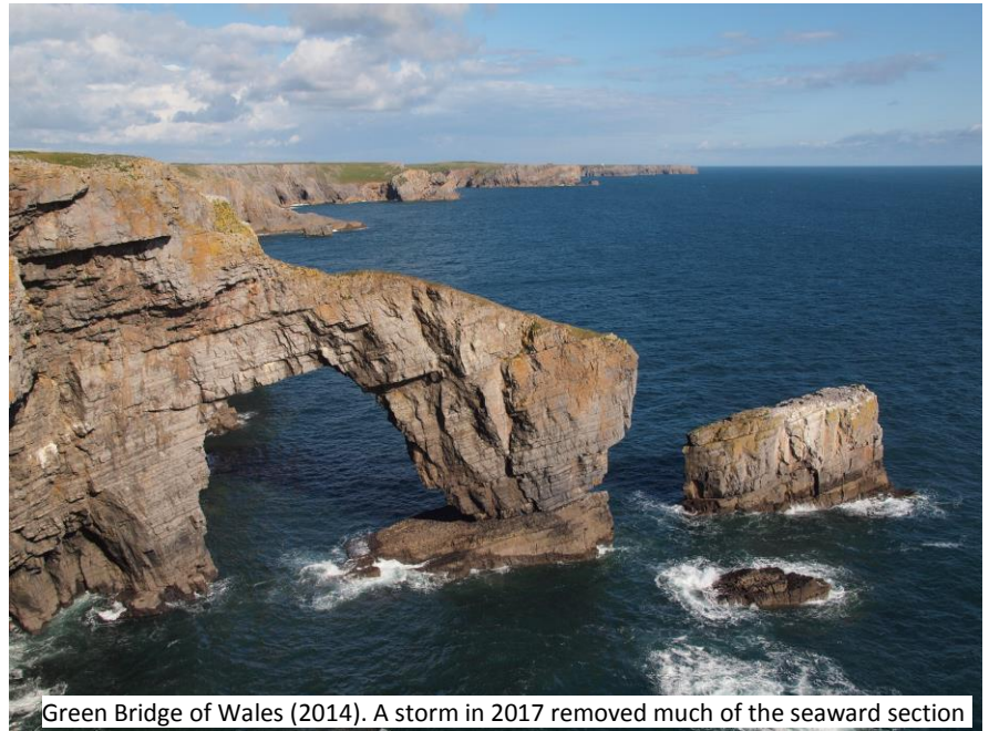
Green Bridge of Wales (2014). A storm in 2017 removed much of the seaward section

Look along the cliff top which is uniformly level at around 60 m above sea-level across much of Pembrokeshire. This is due to marine erosion during a period with extreme high sea-level relative to the land during the Tertiary.