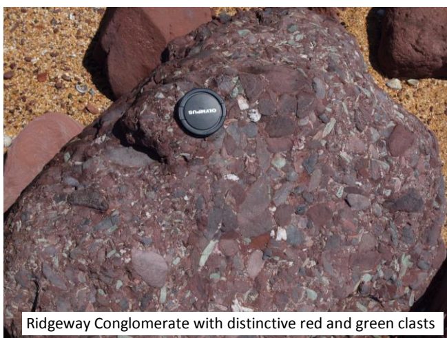
Ridgeway Conglomerate with distinctive red and green clasts

If the tide allows, pass through the gap in the headland, or otherwise return to the cliff top and walk round to the southern bay.