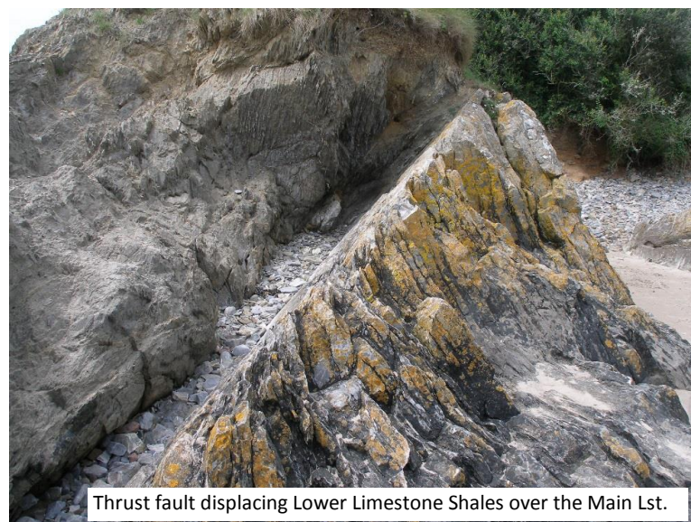
Thrust fault displacing Lower Limestone Shales over the Main Lst.

Returning to the main bay by the car park, note that this has a synclinal structure with the basal Carboniferous (Tournaisian) beds, the Lower Limestone Shales (Avon Group), forming the headlands. They are mostly vertically bedded, and the upper part forms a prominent rib dividing the Third and Second North Coves. These pass up into the Main Limestone (Pembroke Limestone Group/Black Rock Limestone Subgroup), which form the centre of the bay and which can be best seen in the Second North Cove. Here you can also see some interesting periclinal folds, and the multiple lines of an obvious thrust complex which brings the Lower Limestone Shales back into the next small headland.