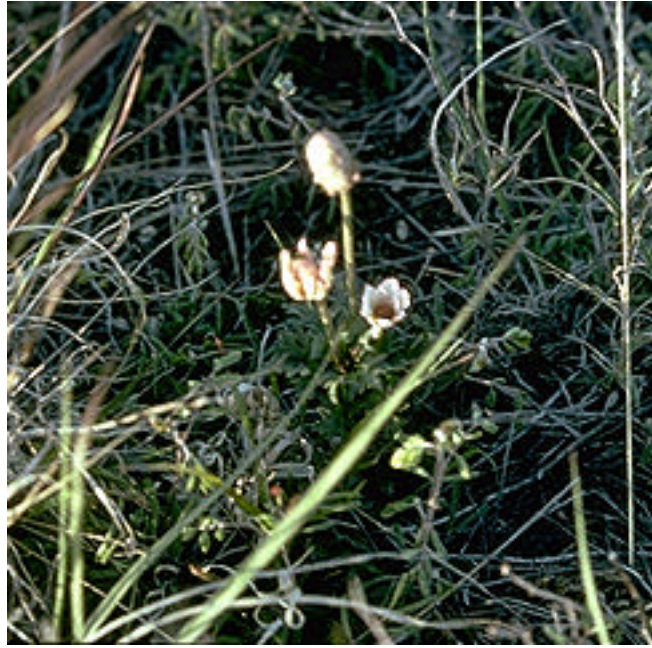
Anemone tuberosa - Desert Windflower - SE Arizona Thicket habit