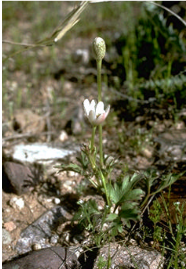
Anemone tuberosa - Desert Windflower - SE Arizona Open rocky habit

SOUTHWEST SCHOOL OF BOTANICAL MEDICINE PO Box 4565, Bisbee, AZ 85603