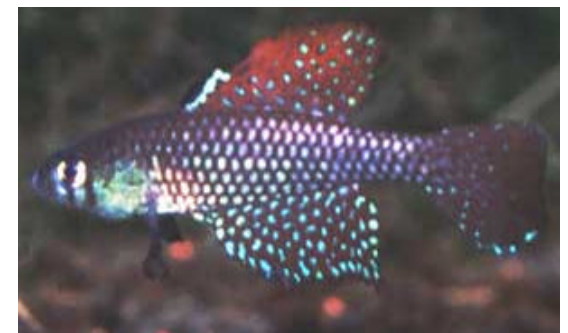
Simpsonichthys sp. Blue Ruby "Rio Xingu", photo by Michael Schlüter.