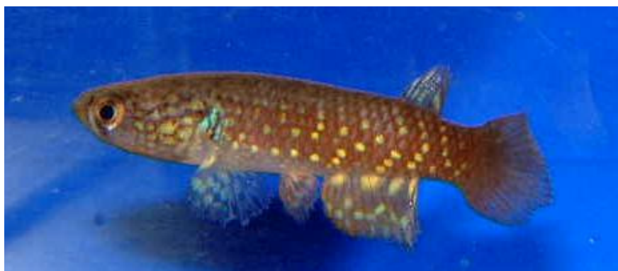
Pituna sp. aff compacta "Rio Xingu"