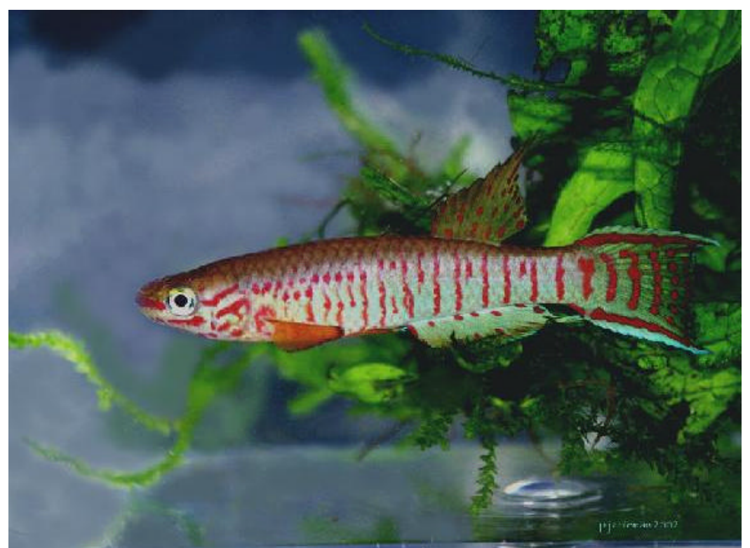
Aphyosemion elberti "N'douzem", a new import from Cameroon.