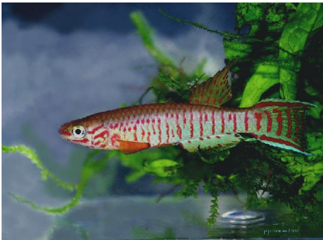
Aphyosemion elberti "N'douzem", a new import from Cameroon.