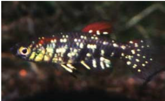
Plesiolebias sp. aff xavantei "Rio Xingu"