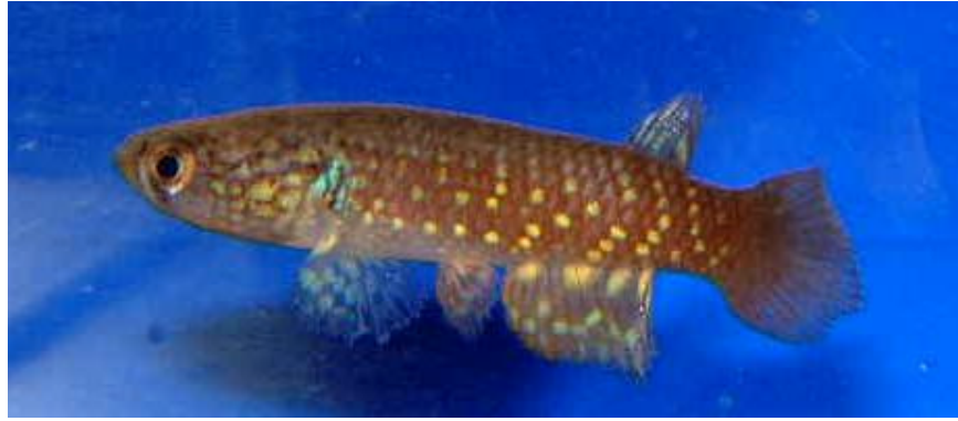
Pituna sp. aff compacta "Rio Xingu"