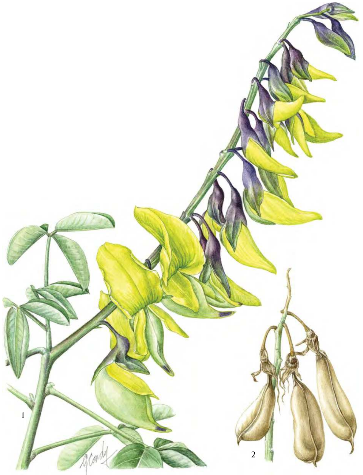
PLATE 2287 Crotalaria agatiflora subsp. agatiflora