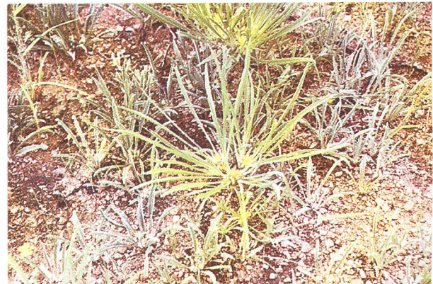
Geigeria ornativa (Vermeerbos)