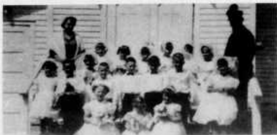
Last Communion Class in the Old Church