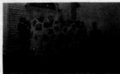
First Holy Communion Class 1920