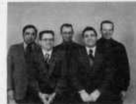
Parish Council 1974