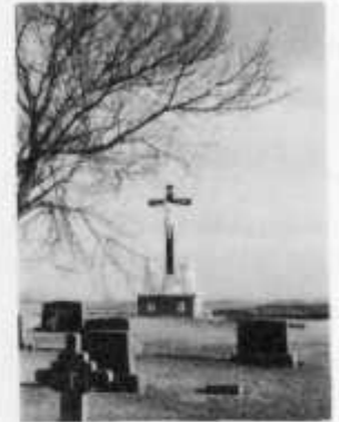
St. Francis Xavier Cemetery