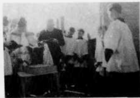
Laying of corner stone