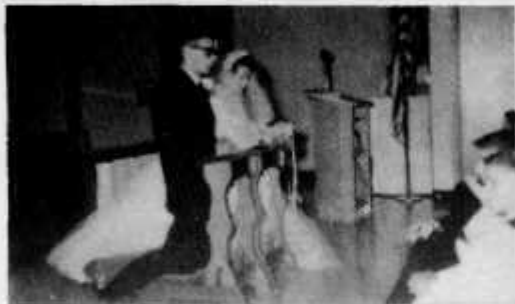
First Wedding in new Church

The new rectory is 100 x 32 ft. with the parish social hall in the basement.