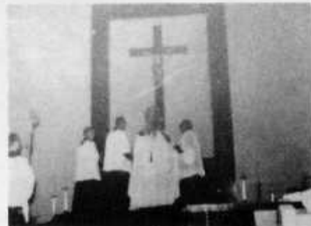
Dedication May 25, 1961