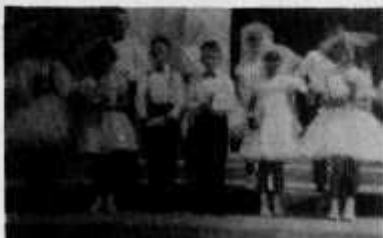
First Communion Class in New Church -1961