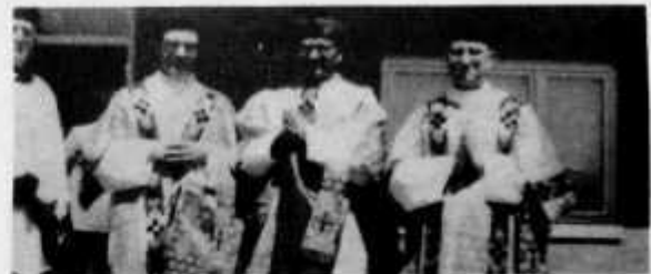
Dedication May 25, 1961

The new church is of brick and block construction with exposed wood beams and block walls on the interior. The seating capacity is about 330. Ten tons of granite were used in the Altar, Communion Rail, side altars and baptismal font.