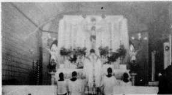
Mass in the old Church