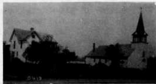
A early view of the first Church