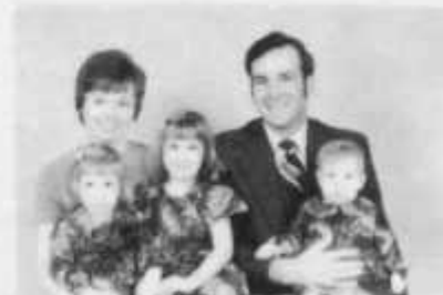
Alloys Setzler Family