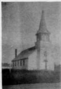
The First Church