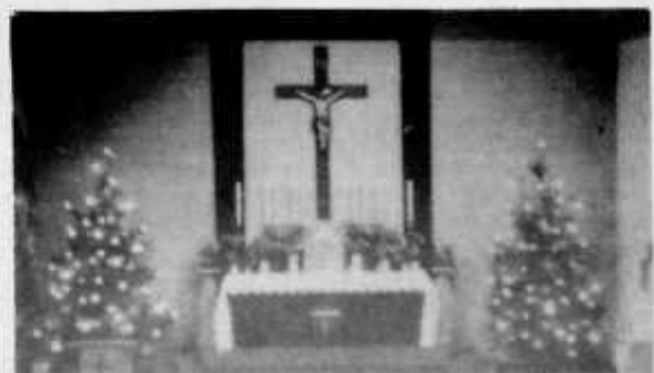
St. Francis Xavier Church at Christmas

The new church is of brick and block construction with exposed wood beams and block walls on the interior. The seating capacity is about 330. Ten tons of granite were used in the Altar, Communion Rail, side altars and baptismal font.