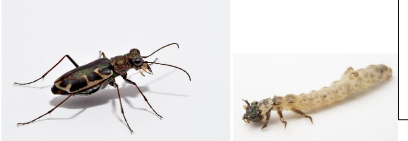
Fig1: Adult Female Cicindela nevadica lincolniana , photo by Jeremy Dixon. Third instar C. n. lincolniana larva, photo by Joel Sartore.

Tiger beetles are considered an indicator species or sentinel organisms for environmental health, due to their diet of small invertebrates and specialized breeding requirements. An estimated 15 percent of the 255 described species and subspecies of North American tiger beetles are now threatened with extinction (Pearson, 2011). The saline wetlands of Lancaster county in eastern Nebraska are home to one such beetle, an endemic subspecies of the Nevada Tiger Beetle, Cicindela nevadica (Palmer & Klatt, 2014). This beetle is aptly named the Salt Creek tiger beetle, Cicindela nevadica lincolniana , due to its presence only along Little Salt Creek and associated tributaries (Spomer, et al. 2007).