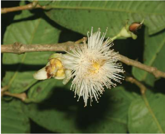
Syzygium rama - varmae