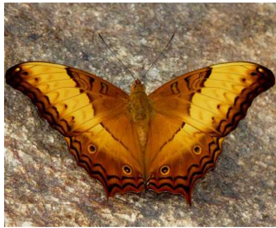
Cruiser Vindula erota