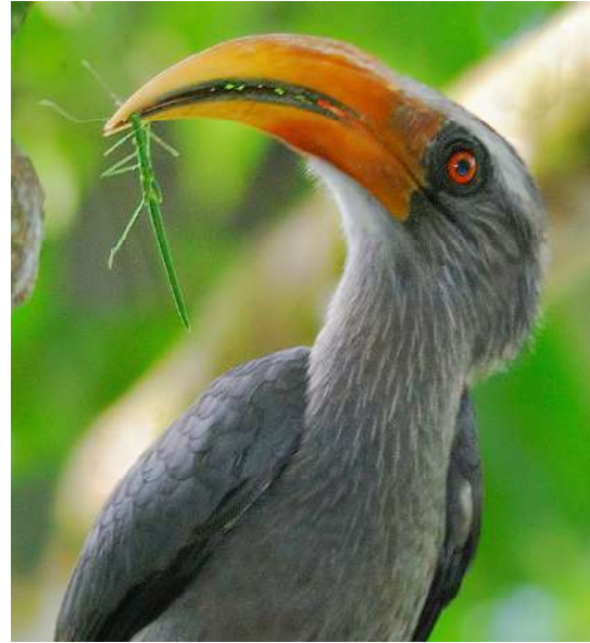
Malabar Grey Hornbill