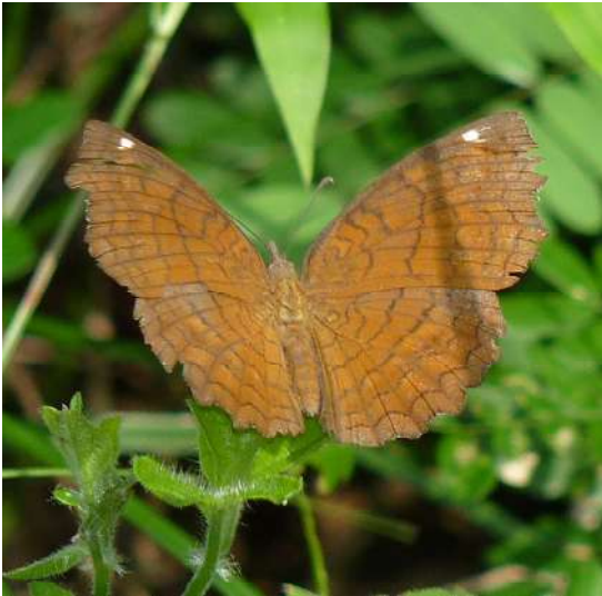
Angled castor Ariadne ariadne