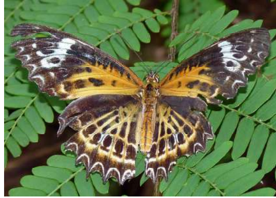
Tamil lacewing Cethosia nietneri