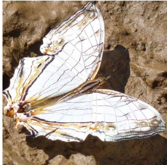
Common Map Cyrestis thydamas