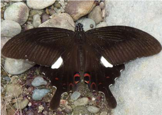
Red Helen Papilio helenus