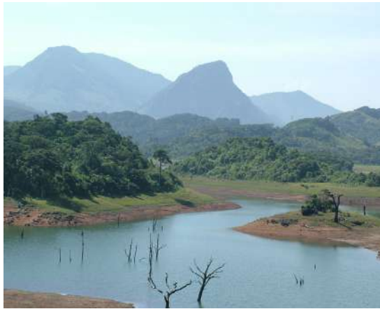
Upper Kodayar - catchment area (A view of Vanamuti and Surutuvamalai)