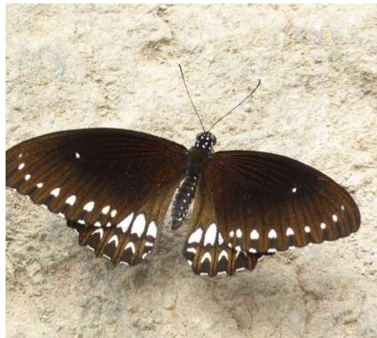
Malabar Raven Papilio dravidarum