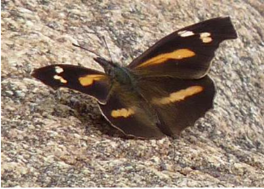
Club Beak Libythea myrrha