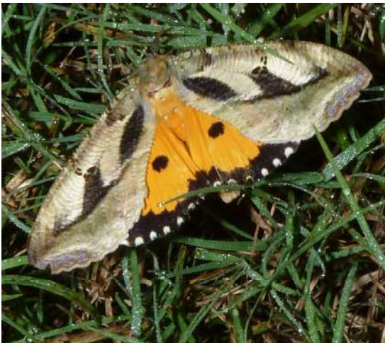
Fissidens taxifolius var. auriculatus