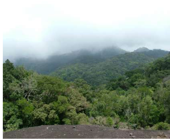
Vattaparai - Tropical evergreen forests