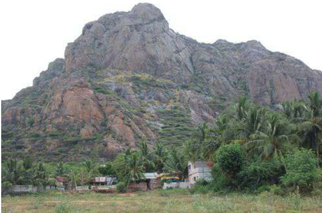
Maruthuvamalai the tail end of Western Ghats

The geological formations are mostly of Archaean age represented by gneisses and granites. The Pothigai rocks belong to granitoid with numerous small pink garnets of inferior type. Kodayar and Muthuzhivayal are mostly formation of granatiferous sillimanite-graphita gneisses and garnet biotite gneisses. Gemstones of chrysoberyl and aquamarine are seen in sengumal, Mahendragiri, Kalivayalpil. Rivers and stream beds consist of alluvial sandy soil. The valleys and lowlying areas are mostly loamy and sandy or clayey.