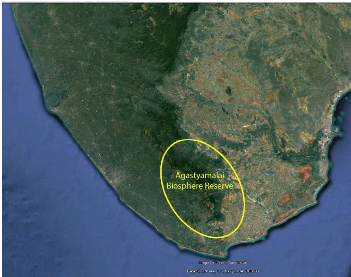
Map 1: Agastyamalai Biosphere Reserve

According to Ramesh and Pascal (1997) 70% of the tree species found in Agastyamalai are endemic. Ramesh (2001) states that the high degree of endemism in Agastyamalai is due to a combination of factors such as, elevation,