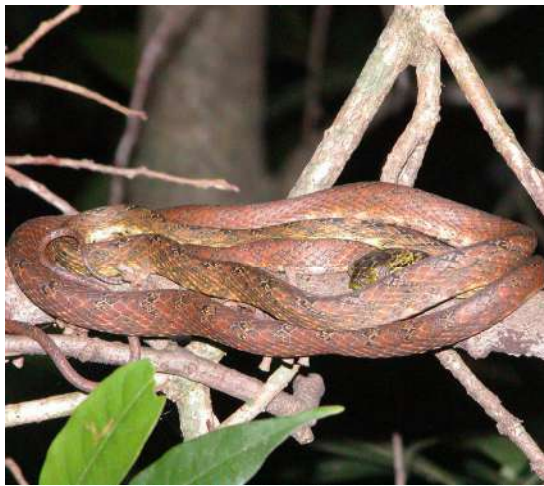
Bronzeback tree snake