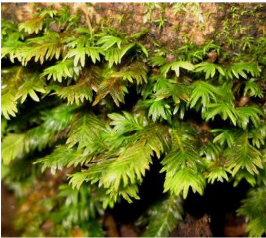
Fissidens taxifolius var. auriculatus