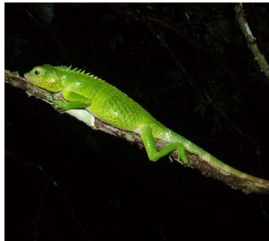
Large-scaled forest lizard