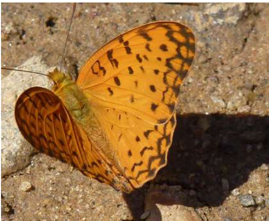
Common leopard Phalanta phalantha