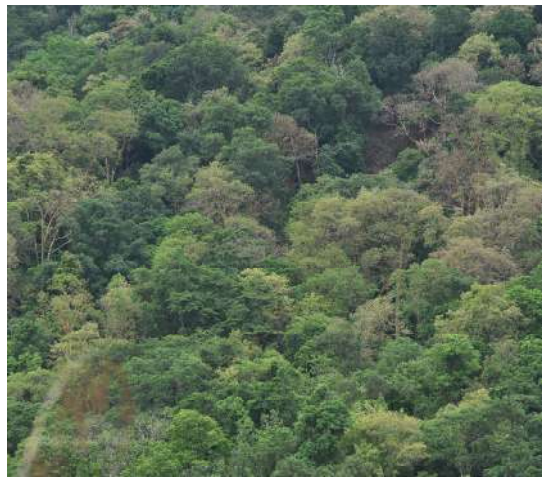
Maramalai - Moist Deciduous Forests