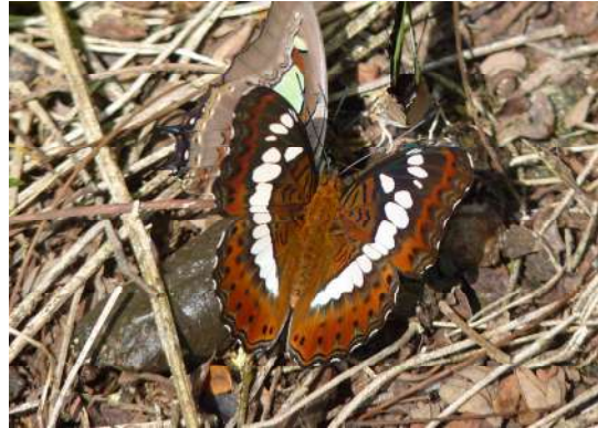
Commander Moduza procris