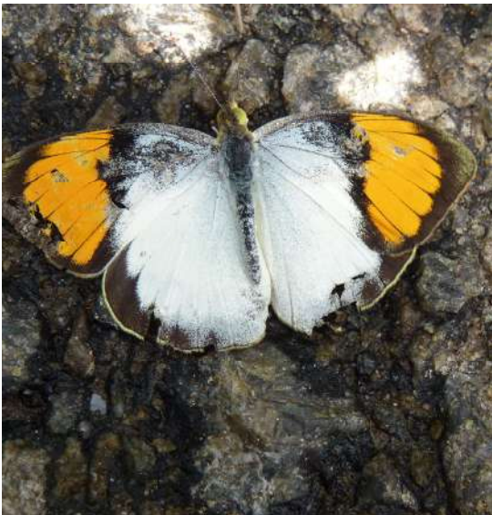
White orange tip Ixias marianne