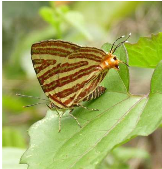
Long Banded Silverline Spindasis lohita