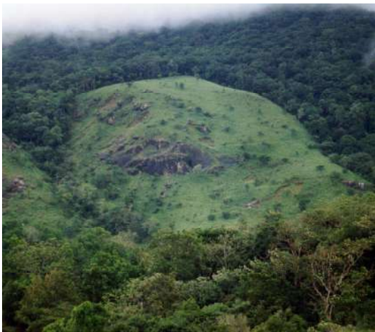
Chamikutchi - Shola Forest