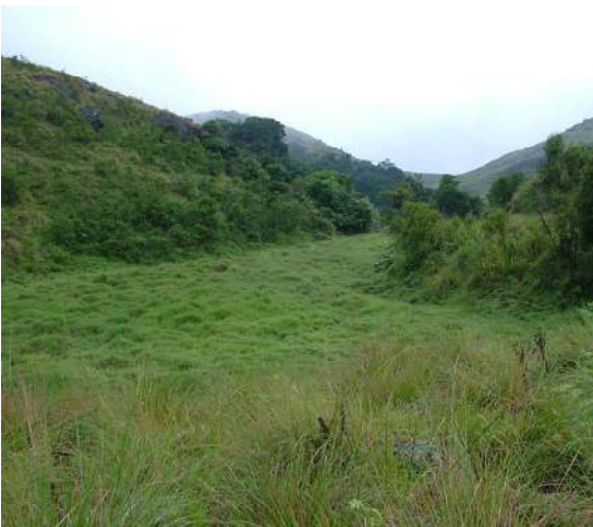
Muthuzhivayal - Grassland