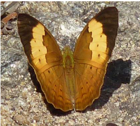
Southern Rustic Cupha erymanthis