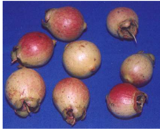
Syzygium rama - varmae