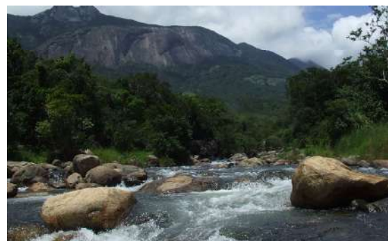
River in Agasthyamalai