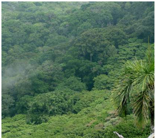
Vanamuti - Wet Evergreen Forests