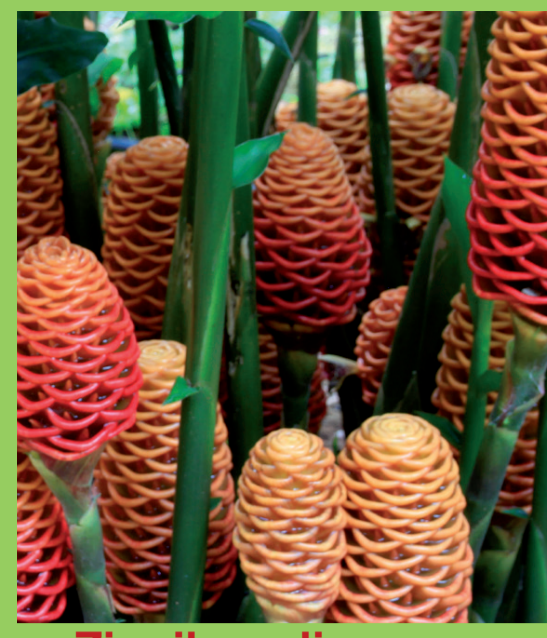
Zingiber olivaceum 'Dark Apricot'

A tall stemmed ginger with large deep green leaves and attractive long lasting apricot inflorescence in summer, likes warm part shade and rich well drained soil. Grows to 2m high. Great cut flower.