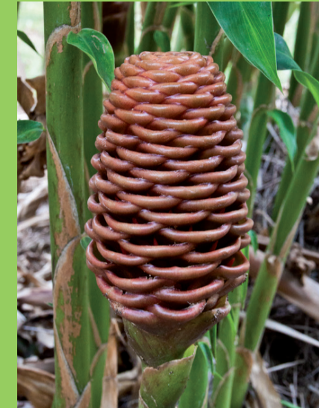
Zingiber sp. 'Coffee'

A new beehive. A compact medium clumping plant, produces inflorescence on short basal stems early summer, great cut flower. Grows to 2m high in part sun to light shade. Prefers well drained rich soil.