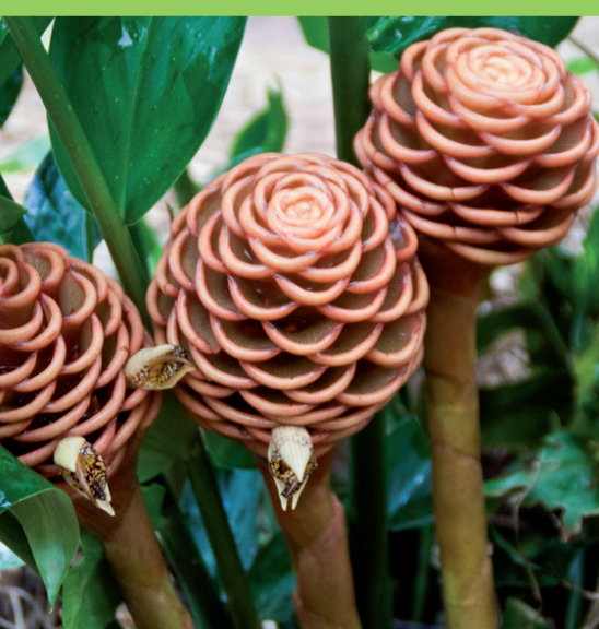
Zingiber sp. 'Red Rocket'

A prolific grower 2.5-3m high, producing good strong medium sized inflorescence on basal stems early summer, great cut flower. Prefers medium sun to part shade, rich well drained soil.