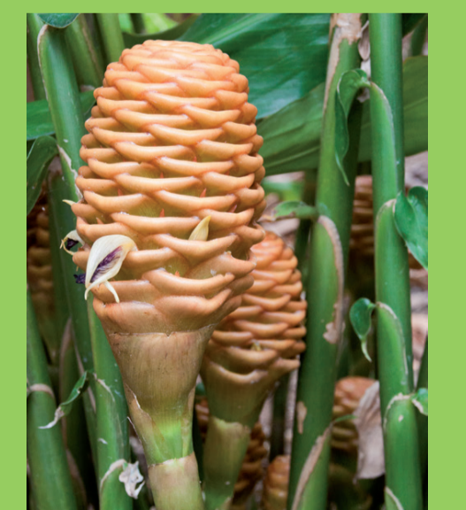
Zingiber sp. 'Toffee'

A medium compact grower to 2m high, produces small light green ageing to brilliant red inflorescence on basal stems in summer. Prefers filtered light and well drained rich soil. Dormant in winter.