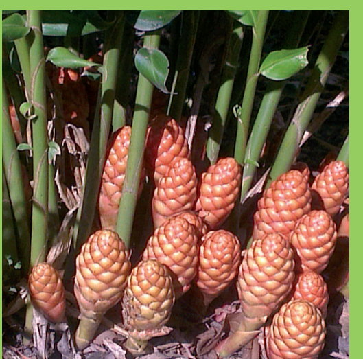
Zingiber sp. 'Ochre'

This new beehive is a compact medium grower from Darwin producing buttery yellow inflorescences on short basal stems early summer. Prefers light shade in a sheltered position and well drained rich soils. Grows 2-2.5m high. Great cut flower.