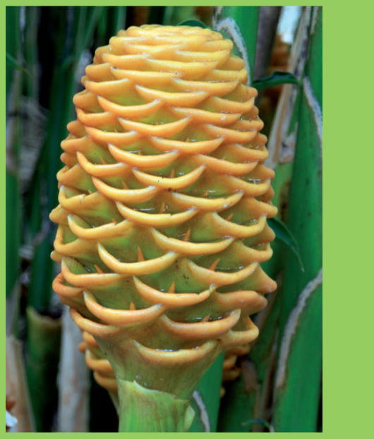
Zingiber sp. 'Golden Glory'

Tall species producing large golden inflorescence on basal stems in summer. Grows to 2.5m high in medium sun and rich well drained soil. Great cut flower.