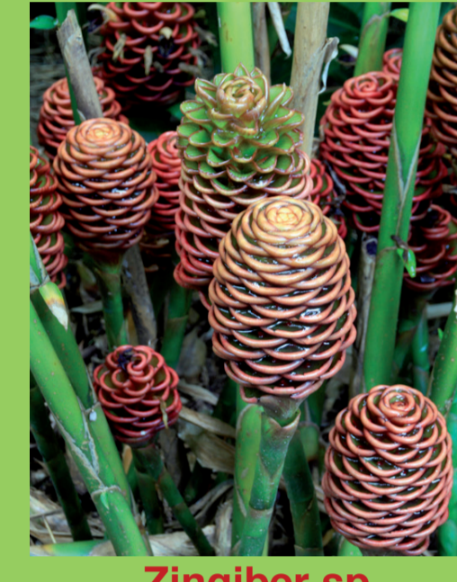
Zingiber sp 'Giant Chocolate'

A striking beehive growing to 2.5m high. Prefers rich, well-drained soil and medium sun to part shade. Produces large orange inflorescence on tall basal stems in summer. Great cut flower.