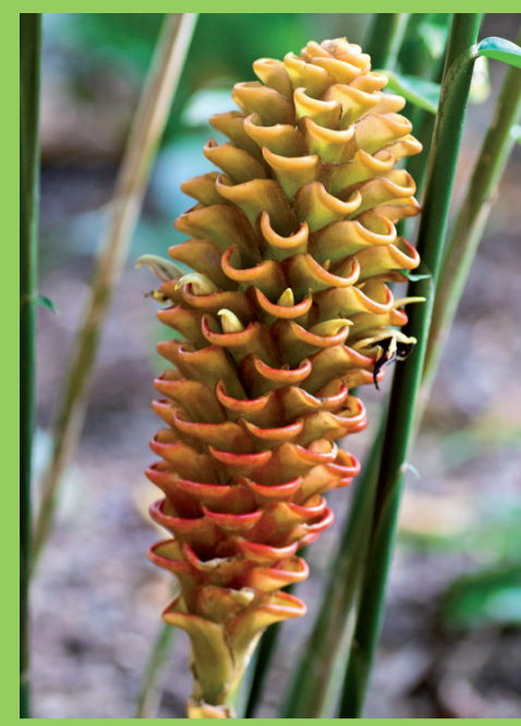
Zingiber fraser hill

A great foliage plant with dark green leaves streaked with silver, grows 0.5-1m high, dormant in winter, produces orange/red basal cones, prefers bright shade and rich well drained soil.