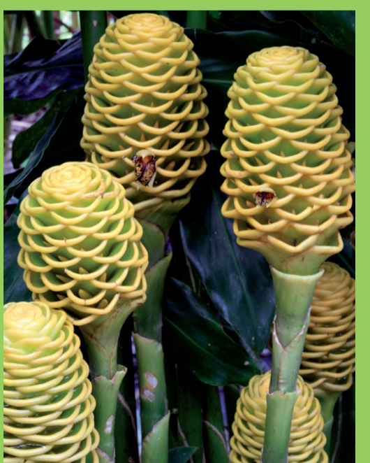
Zingiber sp. 'Pine Lime'

An exciting new beehive producing numerous closed conical inflorescence on short basal stems early summer. Nicknamed 'Little Red', this is a compact landscaper growing to 2m high. Prefers rich moist soil in a semi shaded position. Great cut flower.