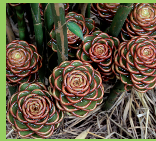
Zingiber macradenia 'Chocolate Beehive Ginger'

Grows to 2.5-3m high, robust, prefers medium sun and well drained rich soil, produces large bronzed amber inflorescence on basal stems in summer. A vigorous grower.