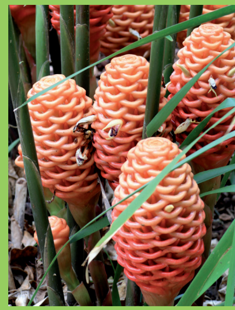
Zingiber olivaceum 'Dwarf Apricot Ginger'

A vigorous grower and a great landscaper. Prefers rich well drained soil and filtered light. Produces numerous apricot coloured inflorescence on basal stems in summer. An excellent cut flower. Grows to 2m high.