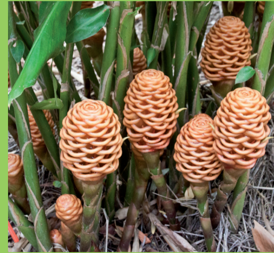
Zingiber sp. 'Blaze'

A medium to large grower with lush green foliage and apricot coloured inflorescence on tall basal stems in summer. A great cut flower. Plant grows to 2m high in filtered light. Prefers rich well drained soil.