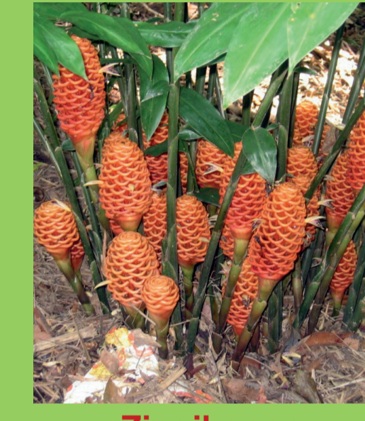
Zingiber sp. 'Giant Amber'

A compact medium clumping plant growing to 2m high. Flowers on short basal stems in summer. A great cut flower. Prefers part sun to light shade and rich well drained soil.