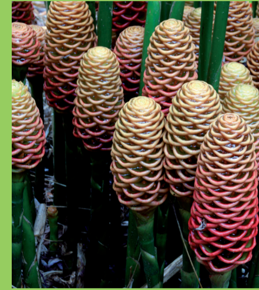
Zingiber sp. 'Apricot Blush'

A compact, hardy, free-flowering plant producing red basal cones primarily in summer. A good landscaping plant. Grows to 2m high in part shade and rich well drained soil.