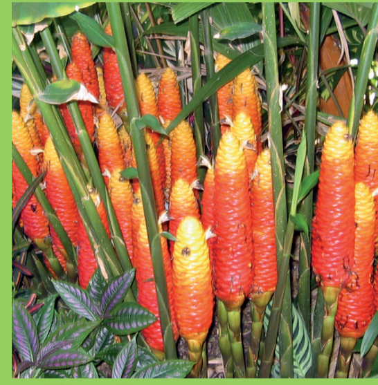
Zingiber olivaceum 'Singapore Gold'

A large plant producing numerous orange inflorescence on basal stems early summer. Grows 2-2.5m high. A compact plant, a great landscaper, good cut flower. Prefers well-drained rich soil and morning sun to part shade.