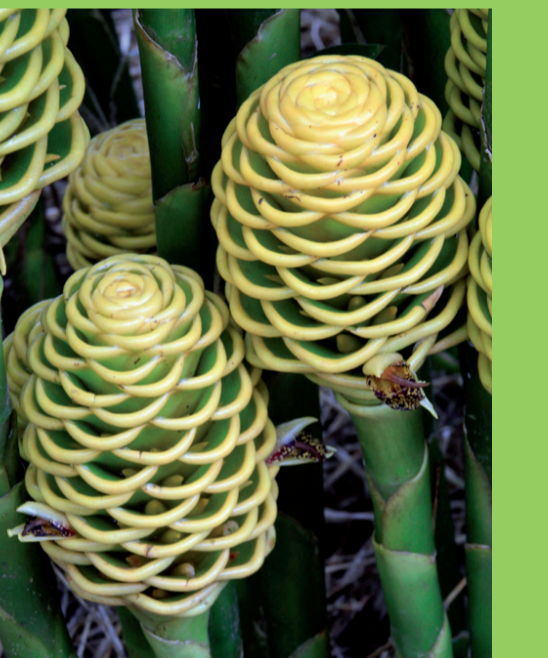
Zingiber sp. 'Grasshopper'

A great new large growing beehive plant, grows to 2m high producing numerous large gold cones on tall basal stems early summer. Prefers medium sun to part shade and well-drained rich soil. Excellent cut flower and landscaper.