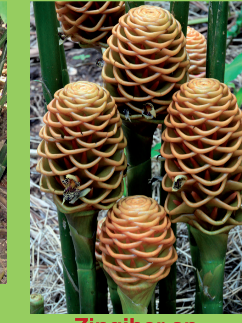
Zingiber sp. 'Giant Orange'

This is a striking plant produces bright orange, compact inflorescence on basal stems with maroon spotted flowers in summer. Grows to 2m high in medium sun, prefers rich well drained soil.