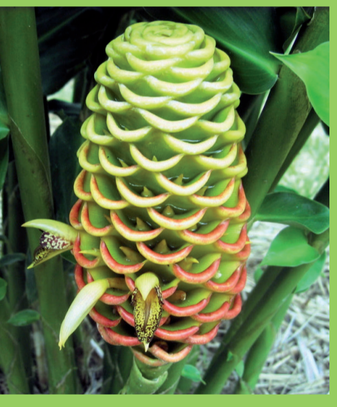
Zingiber sp. 'Malaysian Yellow'

Grows 2.5-3m high in medium sun to part shade and rich well drained soil. Produces green/yellow inflorescence on tall basal stems early summer. A good landscaper and great cut flowers.