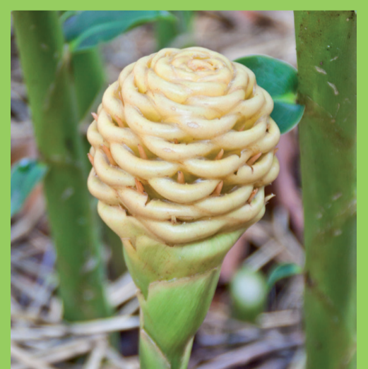
Zingiber sp. 'Mutton Fat'

A new attractive hybrid growing 2-2.5m high, producing a beautiful blend of coffee and chocolate coloured very open bract inflorescence on basal stems early summer. Prefers rich, well-drained soil and a warm position with morning sun only. A great cut flower.