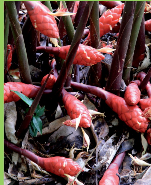
Zingiber peninsulare 'Red Hot Poker'

Grows 2.5-3m high, a compact medium grower producing many light gold inflorescence on medium length basal stems early summer. A great landscaper with dark stems. Prefers medium sun to part shade and rich well drained soil.