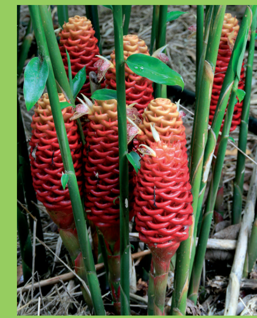
Zingiber olivaceum 'Dwarf Orange Ginger'

A compact medium clumping plant, bracts appear early in summer on short basal stems, great cut flower, prefers morning sun to 50% shade and rich well drained soil, grows to 2m.