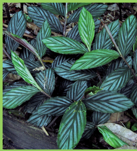
Zingiber collinsii 'Silver Streaks'

A great foliage plant with dark green leaves streaked with silver, grows 0.5-1m high, dormant in winter, produces orange/red basal cones, prefers bright shade and rich well drained soil.