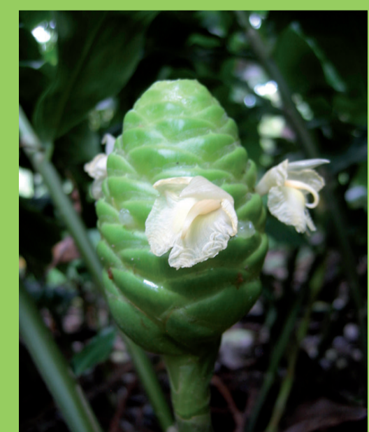
Zingiber zerumbet 'Green Shampoo'

A variegated shampoo ginger with outstanding foliage, grows 1.2-1.5m high. Prefers medium shade and well drained rich soil. Produces variegated green ageing to red inflorescence on basal stems in summer. Dormant in winter.