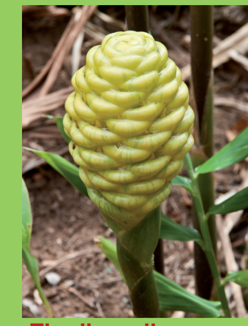
Zingiber olivaceum 'Early Yellow'

A compact medium clumping plant. Bracts appear late spring to early summer on short basal stems. Great cut flower. Prefers morning sun to 1.5-2m high in medium sun and well drained rich soil.