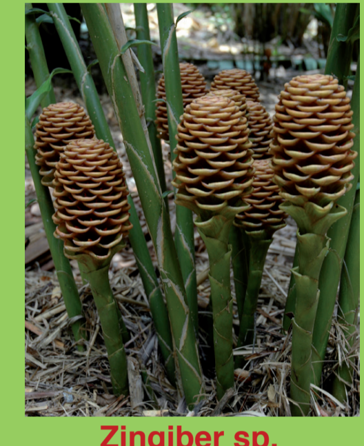
Zingiber sp. 'Giant New Guinea'

The ultimate beehive ginger producing large chocolate inflorescence on tall basal stems in summer. Grows to 2m high. Excellent cut flower and landscaper. Prefers medium sun and well drained rich soil.