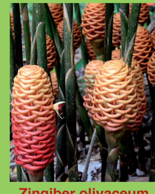
Zingiber olivaceum 'Long Apricot'

A robust species, produces small tight conical bright yellow inflorescence on basal stems in summer. A great cut flower. The plant grows to 1.5-2m high in medium sun and well drained rich soil.