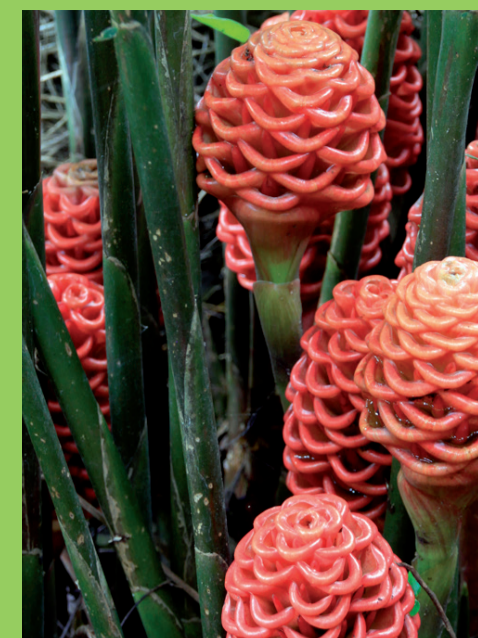
Zingiber olivaceum 'Champagne Ginger'

An outstanding plant for collectors depicting typical zingiber foliage to 1.8m high and eye-catching large red basal cones erupting from the ground. Prefers light shade, rich moist well drained soil.