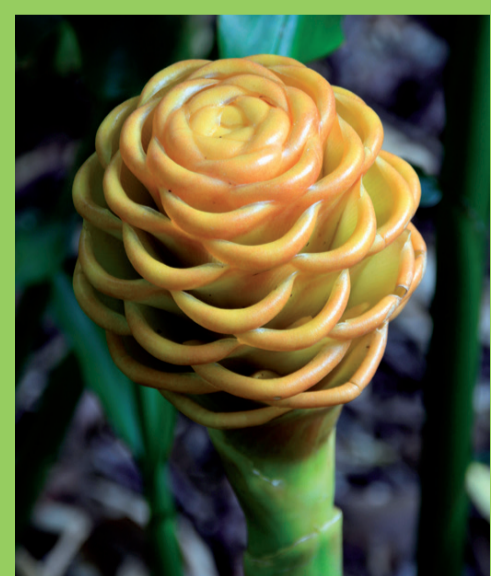
Zingiber sp. 'Sunset'

A compact clumping plant growing to 2.5m high, inflorescence appear early in summer on short basal stems, prefers medium sun to part shade and rich moist well drained soil. Great landscaper and cut flower.