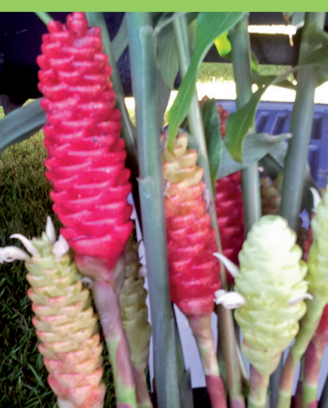
Zingiber sp. 'Thai Ruby'

A hybrid from Darwin, a prolific grower to 2.5-3m high, produces good strong rounded head inflorescence on basal stems early summer, great. Prefers medium sun to part shade, rich well drained soil. Great cut flower.