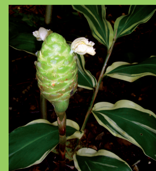
Zingiber zerumbet 'Darcey'

A must for collectors. Grows 0.5-1m high. A small fine leaved zingiber. Leaves have a distinct licorice scent. Prefers a warm sheltered shady position in rich well drained soil. Large conical inflorescence occur on short basal stems in summer.