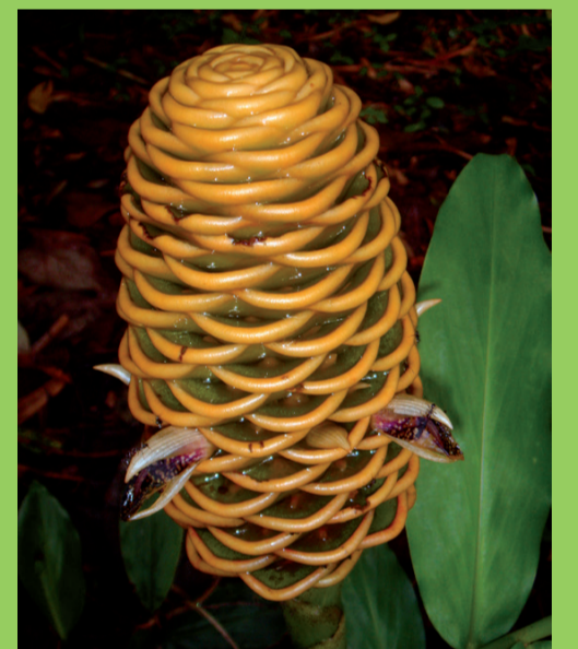
Zingiber sp. 'Golden Beehive'

A robust tall species growing to 2.5m high, producing large bright yellow inflorescence on tall basal stems early summer. Great cut flower. Prefers rich well drained soil and medium sun.