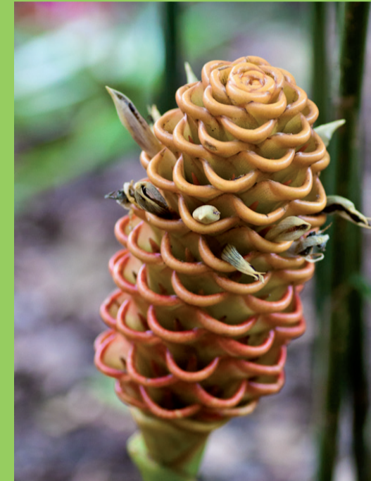
Zingiber sp. 'Darzing'

This large beehive produces coffee coloured inflorescences on tall basal stems in summer. Prefers a warm sheltered position in light shade and rich well drained soils. Grows 3-3.5m high.