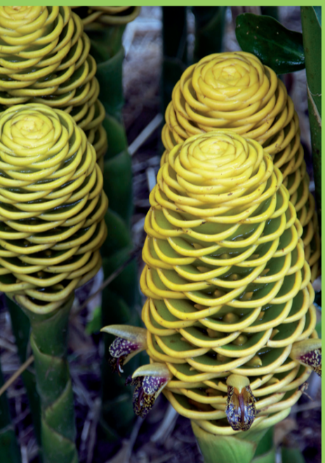
Zingiber sp. 'Green Yellow'

A medium compact grower producing a prolific number of light yellow inflorescence on tall basal stems early summer. Grows to 2.5-3m high. A good cut flower and landscaper.