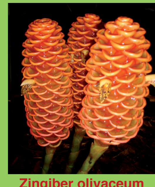
Zingiber olivaceum 'Orange'

A vigorous grower and a great landscaper. Grows 2-2.5m high. Prefers rich well drained soil and filtered light. Produces numerous elongated inflorescence on tall basal stems early summer. An excellent cut flower.