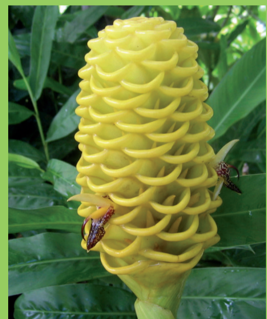
Zingiber sp. 'Giant Yellow'

A large beehive growing to 2.5-3m high, prefers medium sun to light shade and rich well drained soil. Produces many large bronze inflorescence on tall basal stems early summer. A good cut flower.