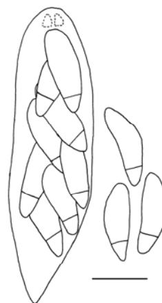
Figure 2. Apiognomonium veneta : ascus and ascospores. Scale bar = 10 \mu\text{m} .

Perithecia (230-) 265-300 \mu\text{m} in diam, black, immersed, non-stromatic, globose or slightly flattened at the base. Beak (70-) 90-130 \times (65-) 80-110 \mu\text{m} , black, central, straight. Asci (35-) 40-55 (-65) \times (7-) 8-12 (-14) \mu\text{m} , clavate to subcylindrical, 8-spored, apical ring 3 \mu\text{m} long. Ascospores 11-16.5 \times 3-4.5 \mu\text{m} ( 13.6 \pm 1.4 \times 3.9 \pm 0.5 ) ( n = 50 ), hyaline, straight or slightly curved, fusiform-ellipsoidal, two-celled, with septum at 1/6 of the spore length, without appendages, overlapping biseriate in the ascus. The bigger cell oriented in the ascus towards the apical annulus, with 2 large or many small globules.