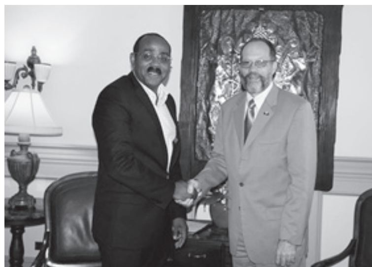
Photo: CARICOM Chairman and Antigua' and Barbuda's Prime Minister the Hon. Gaston Browne (left) and Secretary General of CARICOM, His Excellency Irwin Laroque

La Rocque said that the leaders had "an interesting encounter with the captains of industry" whose businesses span investments across the Caribbean.