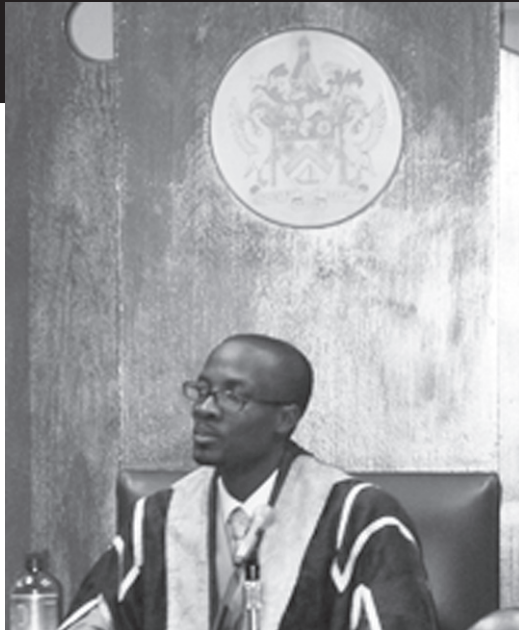
Speaker of the St. Kitts and Nevis National Assembly, the Hon. Curtis Martin

"They had publicly alleged the Honourable Speaker's appeal was frivolous and without merit. They also resisted the application for a stay tooth and nail on the ground, among others, that the appeal has no prospects of success. This allegation has now proved to be false. It was implicitly rejected by the ruling of the Court of Appeal. The appeal will now proceed to the Court of Appeal," the Legal Team statement said.