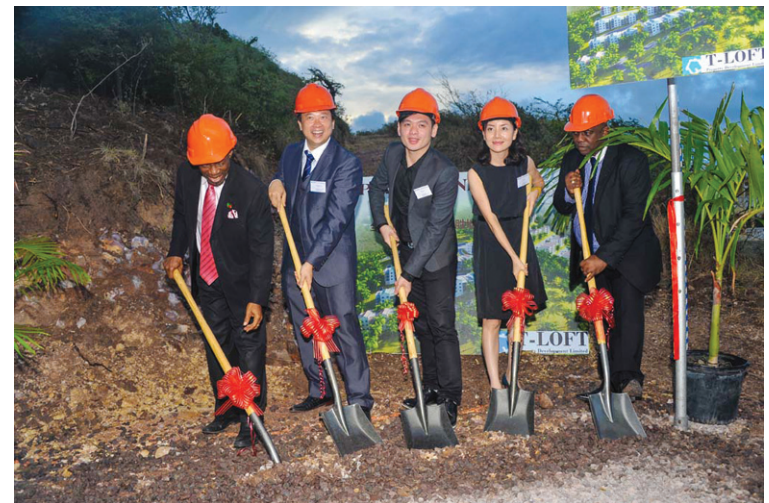
REAL - T-LOFT GROUND BREAKING

BASSETERRE, ST. KITTS, (CUOPM) – Prime Minister the Right Hon. Dr. Denzil L. Douglas marked the 19th anniversary of his ruling St. Kitts-Nevis Labour Party (SKNLP) in power, making reference to the