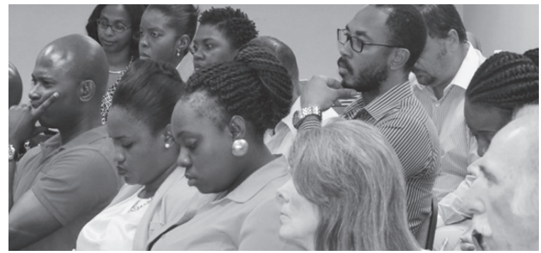
Service providers attending the meeting with St. Kitts and Nevis' Prime Minister the Hon. Dr. Denzil L. Douglas

It adds that they only process and accept applications from "Licensed Authorised Persons (Service Providers)," and "transactions are conducted