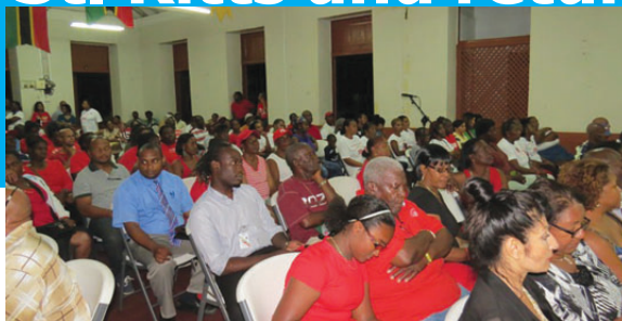
Photo: Part of the large turnout at the Town Hall Meeting on Wednesday night - FULL STORY N PAGE 22

PM Douglas confirms investigation into how a large sum of money from Iraq refused by a bank in St. Kitts and returned, ended up in a personal bank account in Nevis