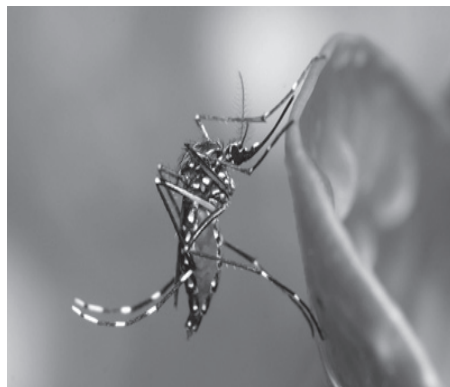
The Aedes aegypti mosquito

Prevention efforts are the same as those for dengue fever. The Ministry of Health strongly urges