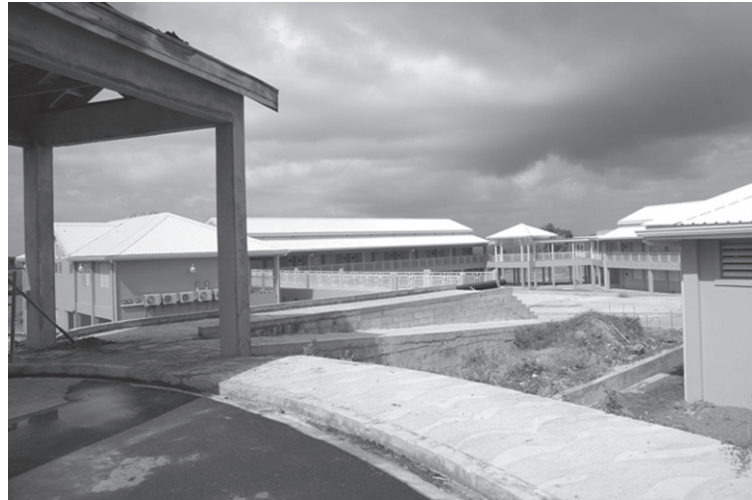
New Saddlers Secondary School (St. Kitts)

"That is all behind us now, thank God. But it was these conditions and the circumstances, it was these unhealthy social and governance realities that propelled us, in the St. Kitts-Nevis Labour Party, to work so very hard first, to win your support, and then, again with your support, to fix and