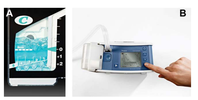
FIG. 4. Assessment of air leaks. (A) Air leak detection chamber of the Atrium Oasis drainage system showing a failed air leak test. The air leak is characterized by the presence of bubbles in the water. The graduated system allows for monitoring of the air leak. A high leak is represented by the number 5 and a low leak by the number 1. The absence of bubbles represents the absence of an air leak. (B) Graphical data readout of the Thopaz digital drainage system. The graphical data allow for objective assessment of air leaks over time, potentially decreasing interobserver variability and misinterpretation of information. A flatline graph represents the absence of an air leak.

Removal of chest tubes is a simple process that requires the tube to be pulled out of the patient without allowing air to enter the site where the tube was present and where it entered the thorax. Most interventionalists will discontinue the tubes that they have placed. Some small catheters have an internal string that has to be released so the catheter will "straighten" and pull out easily. Knowledge of the type of catheter or tube that was placed is critical before removal to prevent complications and patient