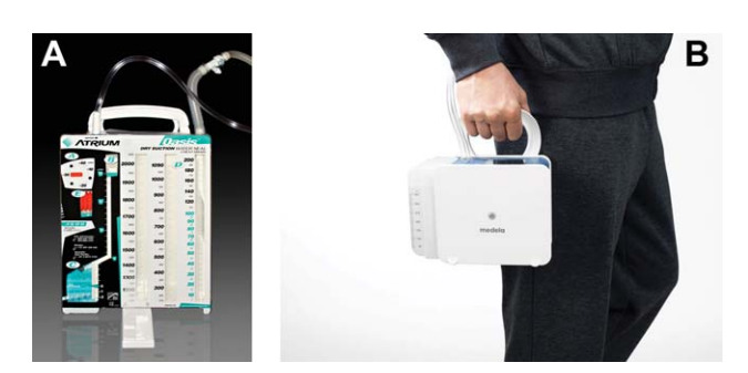
FIG. 3. Drainage systems for pneumothorax. (A) Atrium Oasis drainage system. This multiple-chamber drainage device allows for controlling the level of suction applied from -8 to -40 cm H<sub>2</sub>O pressure (indicated by the letter A in the figure), a water seal chamber (indicated by the letter B in the figure), air leak detection by funneling air through a column of contained water (indicated by the letter C in the figure), quantification of total fluid collection (indicated by the letter D in the figure), and visual evidence of active suction put with orange-colored bellows (indicated by the letter E in the figure). (B) Thopaz digital drainage system. This portable suction unit, with its accompanying collection container (at left), allows greater mobilization of patients.

If there is improvement or resolution of the pneumothorax after 24 hours, the presence of an air leak should be assessed; if no leak is present, the chest tube can be safely removed. In the context of chest tubes, the term air leak refers to residual air between the lung and the chest wall. It is possible to see