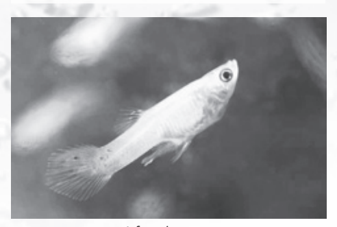
A female guppy

MS Aquaculture Student Institute of Aquaculture College of Fisheries and Ocean Sciences University of the Philippines Visayas