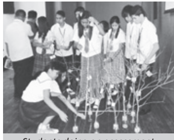
Students doing an assessment

The Fish Conservation Week Celebration aims to emphasize to stakeholders the importance of conservation and proper management of fishery resources.