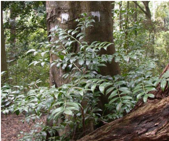
Podocarpus nagi (Podocarpaceae) is a shade tolerant climax forest tree in the native range. The species was intentionally introduced 1200 years ago to the Kasugayama Shrine, and spread in the climax forest. (See p.5 Koike)