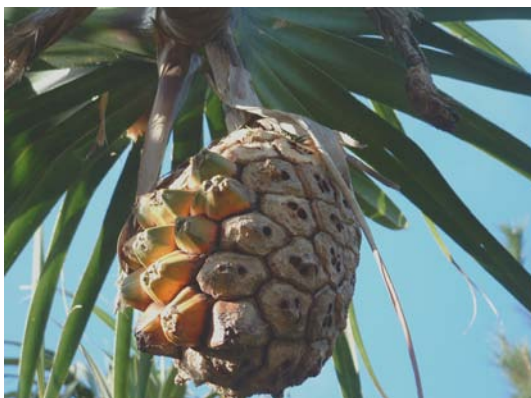
Black rat ( Rattus rattus ) predated fruits of the endemic pandan ( Pandanus boninensis ) in the oceanic islands of Ogasawara. (See p.127 Clout and Russell for eradication of rats from islands)