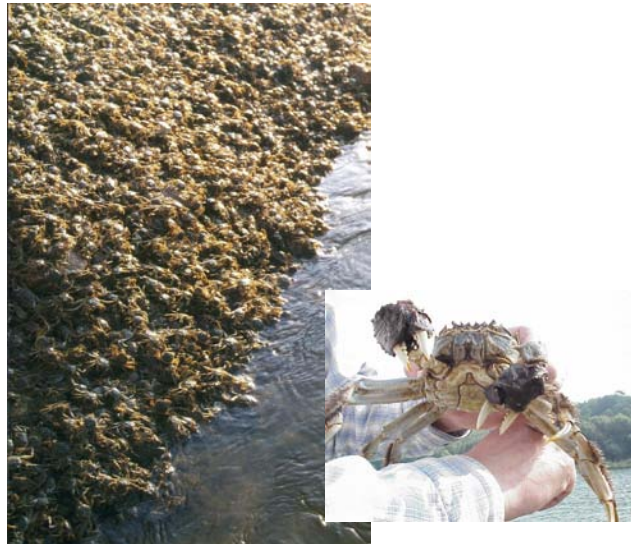
Chinese mitten crab ( Eriocheir sinensis ) naturalised widely. The crabs accumulated at the migration barrier (a salmon support pathway). (See p.104 Iwasaki)