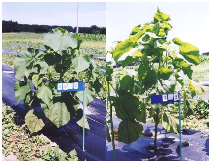
Velvetleaf ( Abutilon theophrasti , Malvaceae) has weedy (left) and cultivated non-weedy (right) strains. (See p.84 Kurokawa et al.)