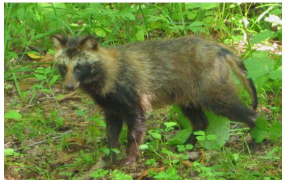
Raccoon dog ( Nyctereutes procyonoides ) is native in east Asia, and probably competing with feral raccoons. (See p.116 Abe et al. )