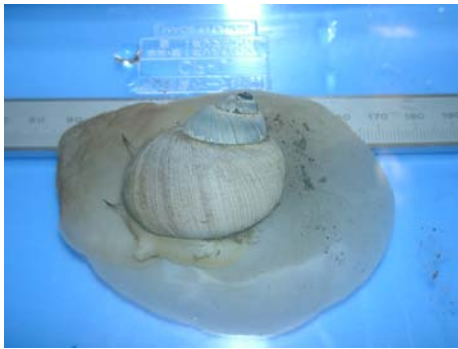
Moon snail ( Euspira fortunei ) predated clam shell causing economic damage. (See p.104 Iwasaki)