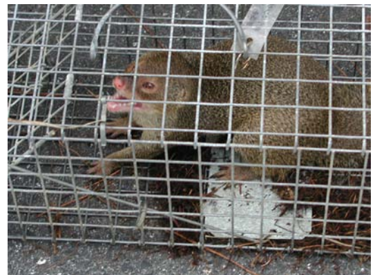
Mongoose ( Herpestes javanicus ) captured by the control operation. (See p.157 Abe et al. ; p.165; Ishii et al. ; p.122 Watari et al. )