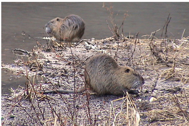
Coypus ( Myocastor coypus ) naturalised in wetlands. (See p.142 Baker)