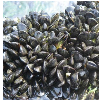
Mediterranean blue mussel ( Mytilus galloprovincialis ) dominates this intertidal shore. (See p.95 Otani; p.104 Iwasaki)