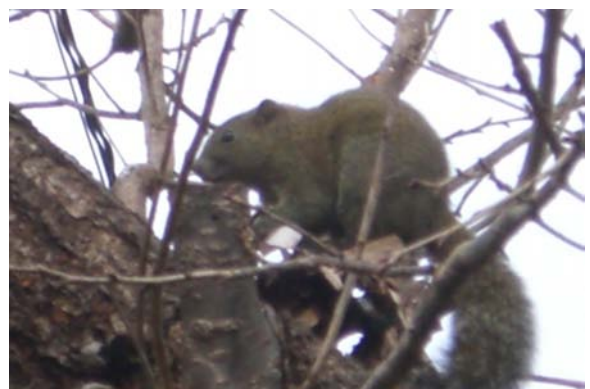
Formosan squirrel ( Callosciurus erythraeus taiwanensis ) and related taxa naturalised in Japan and southern Europe. (See p.204 Hori et al. )